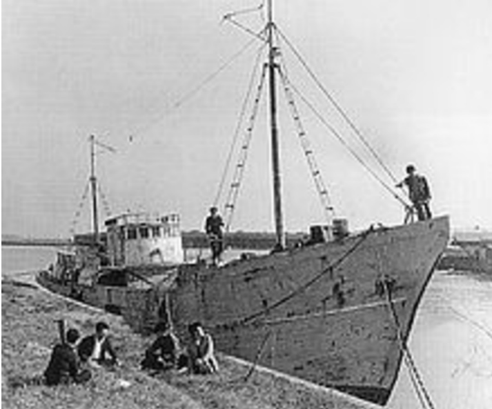
The Lucky Dragon #5 in 1954

The Lucky Dragon #5 was a wooden ship listed at 99.09 tons. Her actual weight was 140 tons. At the time, wooden ships were limited to 100 tons. So the ship weighed 99.09 tons to meet the limit, then inspectors were bribed and 40 tons added. Come to think of it, she was a scary ship. She was eighty-three feet long, nineteen feet at her beam, and drew eight feet.