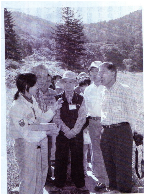
"The Oze Summit 2006" held for the purpose of making Oze a national park. Katsumata Tsunehisa, TEPCO president (chairperson then).

Its publication, Sustainability Report 2010 , introduces approximately fifty environmental activities including participation in Japan Greenhouse Gas Reduction Fund, preservation activities for the Oze National Park, sponsorship of the All-Japan Environmental Activities Eco Conference (Eco-Con), and for a fuel-saving eco school.