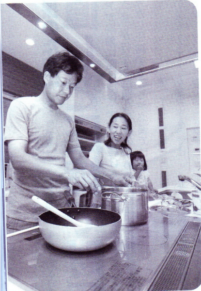
“Total electrification” that electric companies have promoted. In order to spread the idea, they provided opportunities to stay in model houses or renovated rental apartments.