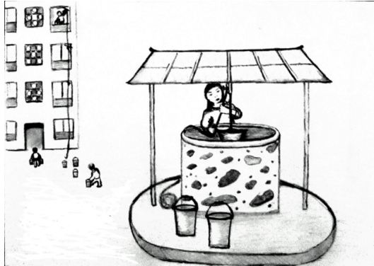
The Well 2: Life in North Korea. Drawing by a "repatriate refugee" of women and children hauling water to the top of an apartment block

Intelligence on the repatriation gathered by the government included letters sent back by "returnees" to their families in Japan. These letters revealed that the standard of living was similar to that of Japan in the desperate final phases of the Pacific War, that many basic commodities including food were in short supply. By August 1961, the Japanese Ministry of Foreign Affairs was secretly sharing this information with allied governments (including the United Kingdom) but despite this knowledge (as far as I can determine) took no steps to reassess the future of the repatriation scheme. 76