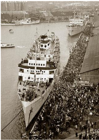
Repatriation ship prepares to depart Niigata Port

To understand the repatriation project, it is essential to recognize that the North Korean side and the Japanese side were in constant (direct and indirect) communication, and each side reacted to moves by the other (though not necessarily in the way that the other side anticipated). Kim Il-Sung's decision in mid-1958 to back a mass repatriation of Zainichi Koreans was taken with the full knowledge that significant sections of the Japanese government strongly favoured mass repatriation, but were afraid of its likely impact on Japan-South Korea relations and of possible objections from the US, and therefore insisted on a central role for the ICRC. If we take this into account, certain aspects of North Korea's strategy become clear. In particular, North Korea's sudden adoption of the idea of a mass repatriation combined with its strong opposition to ICRC involvement can clearly be seen as a move calculated to wreak maximum damage on Japan's relations with South Korea at a crucial moment in their evolution.