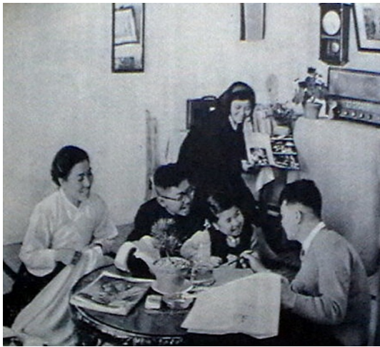
New Home: North Korean propaganda image of "returnees" settling into their new home

share with Sōren and the North Korean government a particular responsibility towards those who suffered as a result of the repatriation. Several questions about Japan's role in the organization of the repatriation also remain to be answered. Why did the Japanese government not insist on a more effective and tightly controlled ICRC "confirmation of free will"? Why did it not seek to find alternative destinations for Korean deportees who justifiably feared deportation to either half of the Korean Peninsula?