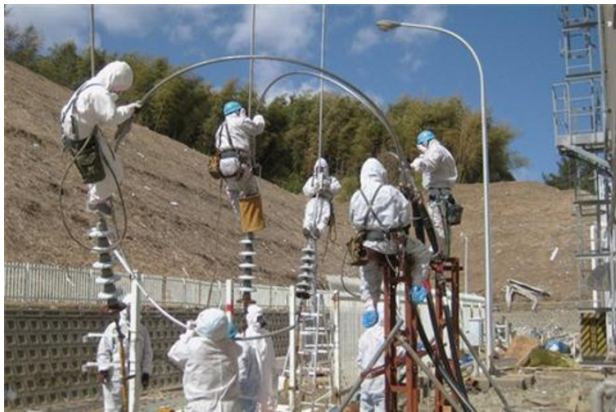
Contract workers doing repairs

Those who answer these offers may have little awareness of the dangers and they are likely to have few other job opportunities. $122 an hour is hardly a king's ransom given the risk of cancer from high radiation levels. But TEPCO and NISA keep diffusing their usual propaganda to minimize the radiation risks.