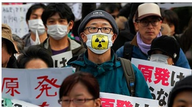
Protestors demonstrated against nuclear power in Tokyo on Sunday, as officials admitted the crisis at the Fukushima Daiichi nuclear plant could take 'months or years' to be resolved.