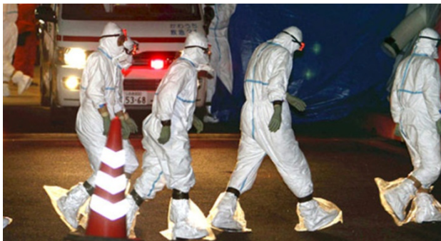
Radiation protective uniforms but not boots. Two TEPCO workers were hospitalized after stepping in radioactive water.

linked to their intervention in nuclear plants. 5 This number is probably very far from the reality of the victims, given the number of workers exposed, and the numerous opacities of that system beginning with the fact that TEPCO and other electric power companies have always refused to disclose the list of their subcontractors.