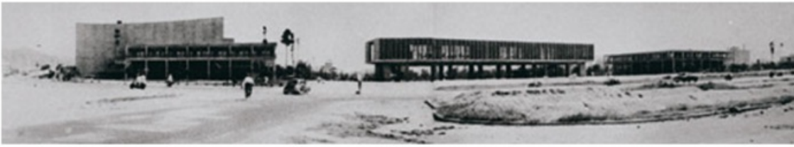
Hiroshima's Peace Memorial Museum under construction in 1955

Although in other cities the exhibition was sponsored exclusively by the Yomiuri with the assistance of the U.S. Information Service, in Hiroshima co-sponsors also included the Hiroshima City Council, Hiroshima Prefectural Government, Hiroshima University, and the Chugoku Newspaper. Twenty local influential persons, including the Mayor of Hiroshima City, the Governor of Hiroshima Prefecture, the President of Hiroshima University and the President of the Chugoku Newspaper, were on the preparatory committee. All praised the promotion and application of this new powerful energy. By contrast, many A-bomb survivors were skeptical and cautious about this non-military application of nuclear power, claiming that there was still no solution to the problem of managing radioactive materials produced by operating nuclear power reactors.