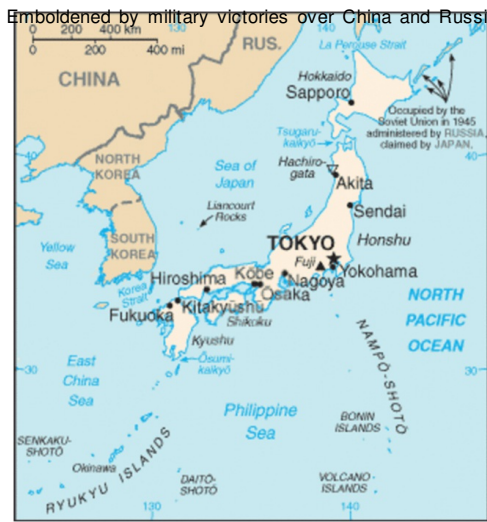
Map shows both Dokdo (Liancourt Rocks) and Senkaku/Diaoyu islands, the latter contested between Japan and China

Emboldened by military victories over China and Russia in 1895 and 1905, and bolstered by British and American support for Japanese claims, Japanese forces proceeded to disband the Korean army in a crackdown that took more than 15,000 Korean lives between 1907-09. In 1907, the Japanese compelled King Kojong, who continued to oppose the protectorate, to retire in favor of his mentally retarded son, Sunjong, en route to the annexation and subordination of Korea to colonial rule in 1910. 6 In other words, for Koreans, the seizure of Dokdo is inseparable from the subjugation and humiliation of the nation at the hands of Japan, a trauma that remains vivid to this day. As Bruce Cumings puts it, “Japanese imperialism stuck a knife in old Korea and twisted it, and that wound has gnawed at the Korean national identity ever since.” 7 For Japan, by contrast, its immediate use in the Russo-Japanese War aside, Dokdo was a matter of little moment. 8 Certainly, it was among the least significant of the numerous territorial conquests over the coming decades, conquests which eventually included Korea, Manchukuo, large areas of China and much of Southeast Asia as well as Micronesia, all incorporated in a vast but short-lived Asia-Pacific empire.