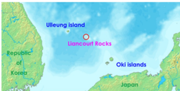
Dokdo/Liancourt Rocks Location: East Sea (Japan Sea) 37°14'30"N 131°52'0"E

Dokdo/Takeshima/Liancourt Rocks (hereafter Dokdo) remains a sharp thorn in the side of contemporary Japan-ROK relations. The contentiousness of the issues is emblematic of unresolved political and territorial legacies of two centuries of colonialism in East Asia as well as of the post-war territorial disposition of the San Francisco Treaty and the global conflict that it mirrored and defined. The story has frequently been told in terms of Japan-ROK conflict. We explore its historical and contemporary ramifications here in a triangular century-long framework involving Japan, Korea and the United States.