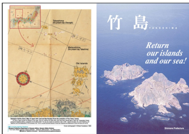
Shimane Prefecture posters laying claim to Takeshima (Dokdo)

Indeed, winds of accommodation quickly dissipated. On February 26, 2005, "Takeshima Day", local officials in Shimane prefecture reiterated the Japanese claim to Dokdo in the highest profile challenge to Korean control. The sentiment was not limited to Shimane. In 2008 newly published Japanese textbooks asserted historical claims to the islets. And on February 22, 2011, officials from the ruling Democratic Party for the first time attended a Shimane event claiming Takeshima for Japan. 27 This was soon followed up by Japan's Ministry of Education issuing new middle school history and social studies textbooks. All twelve textbooks approved for use in the schools claim that Dokdo (Takeshima) belongs to Japan, and four describe South Korea's sovereignty of the islands as "illegal occupation." 28