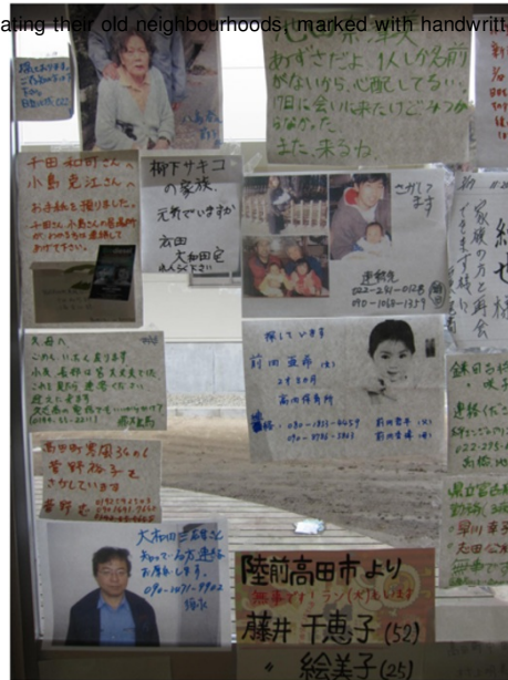
Missing person's wall in refugee center, Rikuzen-Takata