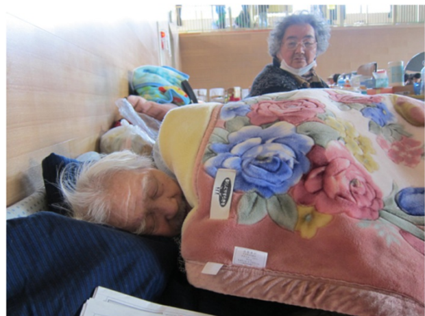
In a couple of weeks, the school must be handed back to its students, scattering this community across the region to hotels, ryokans and temporary shelters.

Shoes are neatly lined up outside the makeshift homes. Old people doze, bored youngsters read comics, legs dangling in the air, their lives in limbo.