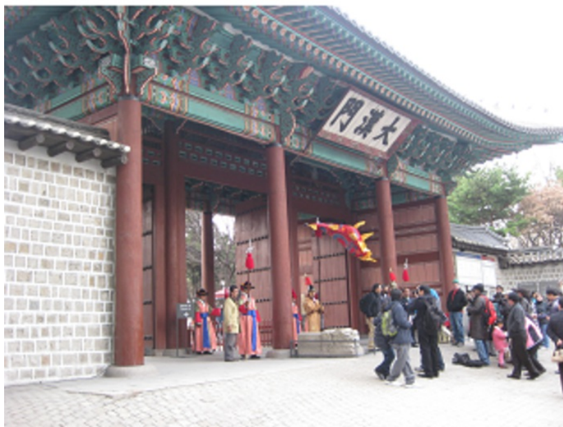
Deoksugung palace (formerly Gyeongungung): Japan sent its elder statesman, Ito Hirobumi, to conclude the protectorate treaty. On 17 November 1905, Ito entered the palace with an escort of Japanese troops, threatened Emperor Kojong and his ministers, and demanded that they accept the draft Protectorate treaty which Japan had prepared. Photo by the author, August 2010.

"Japan sent its elder statesman, Ito Hirobumi, to conclude the protectorate treaty. Ito entered the palace with an escort of Japanese troops, threatened Emperor Kojong and his ministers, and demanded that they accept the draft treaty which Japan had prepared. When the Korean officials refused, Prime Minister Han Kyu-sol, who had expressed the strongest opposition, was dragged from the chamber by Japanese gendarmes.