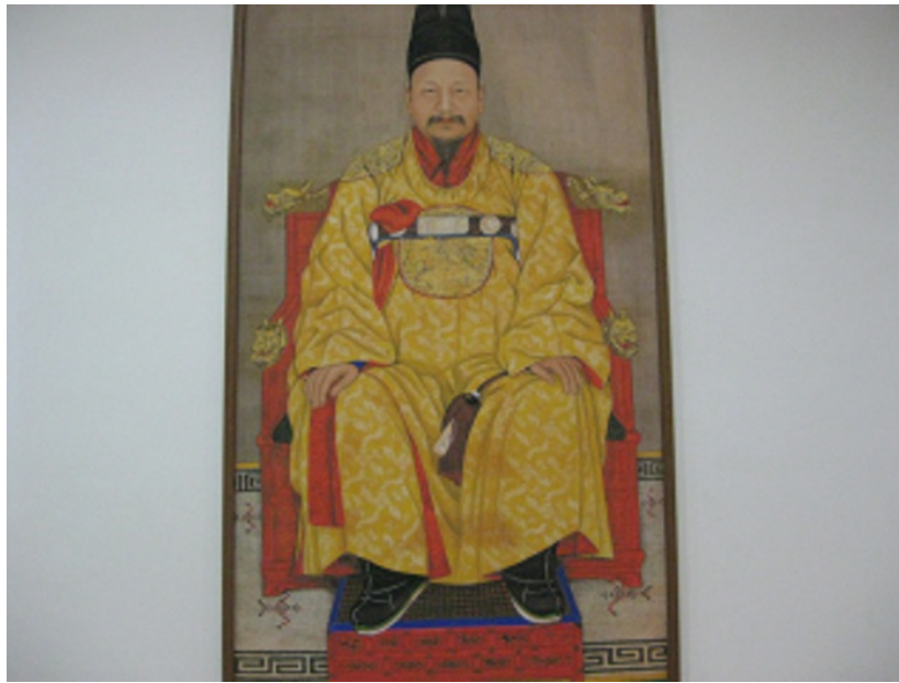
Emperor Gojong refused to sign the 1905 Protectorate Treaty. August 2010 at Jungmyeongjeon