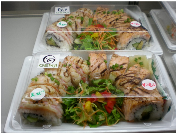
Genji's seared salmon rolled sushi with salad

restaurants. Roppongi is well-known to foreigners too, and it was noticeable that there were many foreigners in the precinct throughout the course of our study there. The restaurant's location among other "foreign" restaurants and stores that sell foreign foods is no coincidence; it clearly aims to link its idiosyncratic health discourse with America as the origin, in contrast to the marketing of the American branches of Genji which emphasise the health discourse and the Japanese influence.