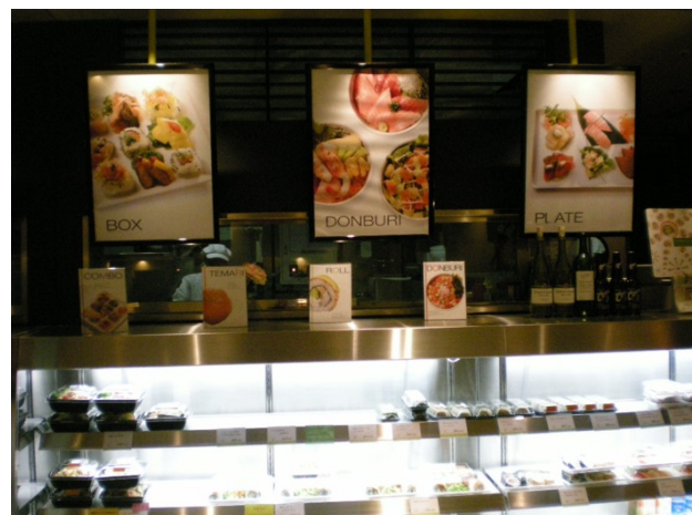
Some of the sushi available at Genji's counter

All seats are non-smoking, which is rare for a Japanese restaurant. 16 There is a takeaway glass-fronted display with salads, sushi sets, and other “healthy” foods displayed. The signage is in English only, and the items on the menu, written in English, have descriptions in Japanese. The menu includes a vast array of fusion sushi and donburi (rice with topping) – California Don, Tuna and avocado Don, Genji seafood salad, etc., with prices set at modest levels. The average cost of a single meal “set” was around 1,000 yen. There were only two employees in the entire restaurant with seating for about 30, so service was negligible, reflected in the price of the food perhaps.