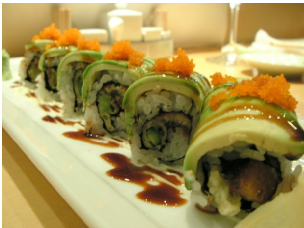
Rainbow Roll Sushi’s dragon roll

sells a large range of unusual roll sushi. In addition to “standard” American sushi like California Roll or Dragon Roll, they offer an array of original roll sushi with interesting and unexpected combinations of fillings such as fried aubergine, shrimp, jalapeno mayo, raw beef, kim-chee, in very unusual combinations.