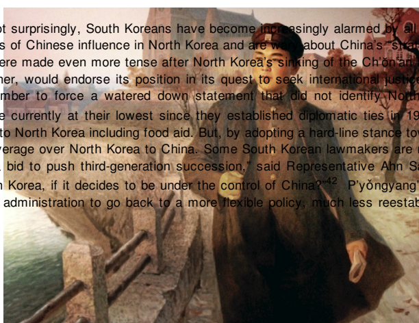
This portrait of a young man was photographed by a Canadian tourist in 2010 and bears a striking resemblance to Kim Jong-un in a setting and layout that is similar to depictions of the young Kim Il Sung. Many North Korea experts believe that the portrait marks the first glimpse of how the North Korean regime plans to "sell" the heir apparent to the public. 38