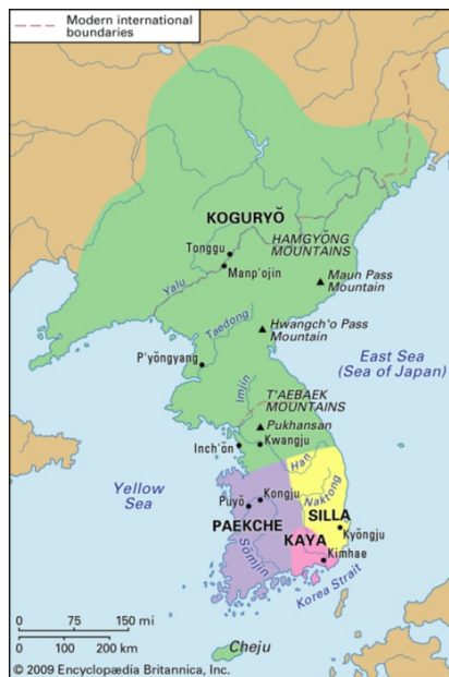
Map of the Three Kingdoms (300 AD-700AD)

China's treatment of Koguryō has not been all that different from its treatment of other peoples and states that are now part of the People's Republic of China. 17 Knowing that the threat to the integrity of the Chinese nation has historically always come from internal challenges to its central authority, China has long sought to exercise control over its diverse ethnic population by promoting a common Chinese identity under the rubric of a "multi-ethnic nation" and conducting assimilationist policies. 18 The link made between Koguryō and Northeast provinces like Jilin, whose largest minority is ethnic Korean, has clearly been a way to increase the notion of a Chinese identity among ethnic minorities. According to Quan Zhezhu, the Deputy-Governor of Jilin Province, the Northeast Project was "undertaken to elevate the tradition of patriotism and to maintain unity and stability of [the] Chinese state, the integrity of territorial rights, stability of ethnic minority communities, and national solidarity." 19 In other words, the Project raises political as well as scholarly issues "linked to China's territorial rights and sovereignty." 20