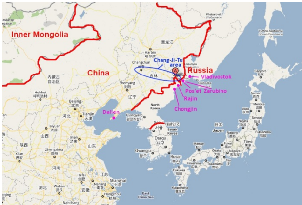
Changchun-Jilin- and Tumen River area

The pressing question that the North Korean regime now confronts in the face of a new reality of becoming a "fourth province of northeastern China" is how to sell it to the North Korean people. For a regime which has always touted ch'uche (self-reliance) as the core principle of its nationalist ideology, such dependence would likely trigger a mass legitimization crisis. It would be hard to justify North Korea's chuch'e philosophy of self-reliance and the regime's repeated denunciation of South Korean "flunkyism" while becoming an economic satellite of China. Hence, the continued efforts to demonstrate "independence" from China, even to the extent of creating international crises to galvanize domestic public support for the regime. This has become all the more urgent since Kim Jong Il is trying to coordinate a delicate and tricky "dynastic" succession. The regime's new heir apparent, Kim Jong Il's son Kim Jŏng-un, was introduced to the North Korean public in 2010. According to sources familiar with the North Korean situation, Kim Jong Il "has become obsessed with creating political stability to allow orderly succession." 28 Chinese leaders are aware of the delicate situation, which is why they will tolerate Kim's antics in the belief that he will not actually start a war.