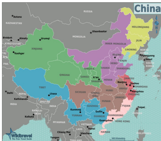
Heilongjiang, Jilin and Liaoning Provinces and North Korea.

Despite China's increasing involvement in North Korea, Chinese leaders realize that merely propping up the regime without fundamentally transforming its economy will not resolve China's main security dilemma in the region: maintaining stability and peace on the Korean peninsula. Hence, China's ambitious efforts to develop North Korea to prevent the implosion of its economy while also shielding the Kim Jong II regime from internal collapse. This "grand bargain" is certainly distasteful to the North Korean regime, which is used to getting its own way, as for example in conducting a second nuclear test in May 2009. But when the Americans refused North Korean demands for direct talks and concessions and instead pushed for even more punitive UN sanctions, the isolated regime was forced to make amends with China. Kim's decision to snub former President Jimmy Carter, who had come to meet the North Korean leader in August 2010, in favor of a second visit to China less than four months later, demonstrated the regime's priority.