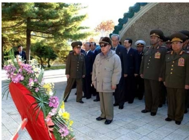
Kim Jong Il, center, laid a wreath in front of the grave of Mao Anying, Mao Zedong's son who died in the war, 26 October 2010.