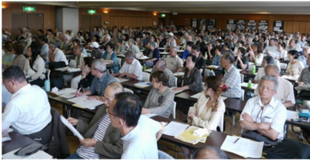
Lawsuit plaintiffs and supporters attending a public meeting in Taito Ward, 2009.