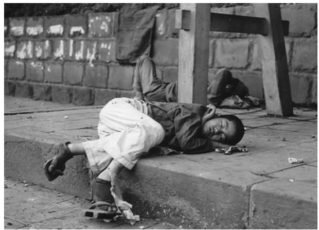
Homeless orphan in postwar Tokyo