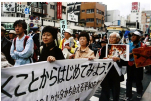
2009 Asakusa “Peace Walk”