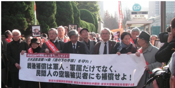
Lawsuit plaintiffs, lawyers, and supporters near the Tokyo District Court, 2009

In 2007, an extraordinary apology by Japanese Prime Minister Abe Shinzō appeared in print. It begins with an acknowledgement that Japan's indiscriminate bombing of civilians living in the Nationalist Chinese wartime capital of Chongqing beginning in 1938 violated international law and gave the United States a justification for its own devastating incendiary raids on Japan's capital. The prime minister also admits that, by not capitulating to the United States once defeat became inevitable, the Japanese government essentially permitted the firebombing of Tokyo and thereafter the rest of urban Japan in 1945. To show the sincerity of its apologetic stance toward Tokyo air raid victims, the state agreed to provide financial compensation to survivors and bereaved family members, conduct a comprehensive survey of the dead, and build a memorial both to honor them and to serve as a reminder that the air raids had occurred. The letter exists only as a suggested template, however, written by plaintiffs who sued the Japanese government seeking such an apology and compensation of 1.23 billion yen (approximately $15 million). 1 In March 2007, sixty-two years after the catastrophic Great Tokyo Air Raid forever changed their lives, 112 survivors and bereaved family members announced their intent to sue the government for redress. The following month, the plaintiffs, the oldest of whom was eighty-six and whose average age was seventy-four, filed the suit with the Tokyo District Court. 2