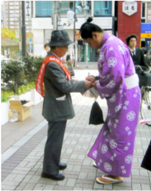
Sumo wrestler near Kameido Station, Koto Ward, signs petition in support of Tokyo air raid lawsuit, 2008.