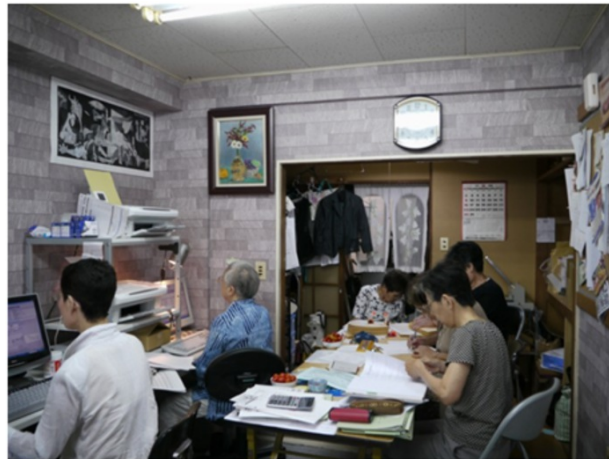
Association of Bereaved Family Members of Tokyo Air Raid Victims office in Oshiage, Sumida Ward.