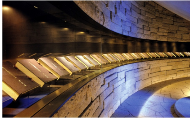
Names of air raid victims inside Yokoamicho Park monument