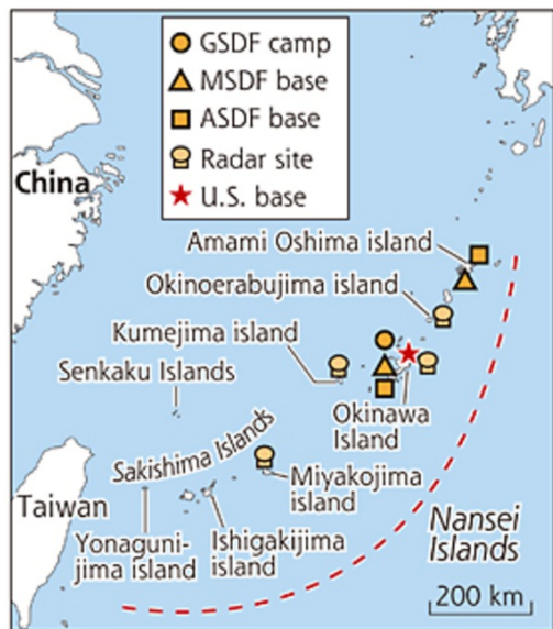
Yomiuri shimbun, 11 November 2010

For Okinawa, the Senkaku incident and the Kan government's military build-up program (in the context of worsening confrontation with China) held especially serious implications. A glance at the map is sufficient to show that access from the heartland of China to the Pacific Ocean requires passage of channels through the Nansei islands between Kyushu and Taiwan. The international waters of the Miyako Strait (between Okinawa Island and Miyako Island) are crucial to China's Pacific Ocean access, and in March and April 2010, several large Chinese naval flotillas passed through them. 43