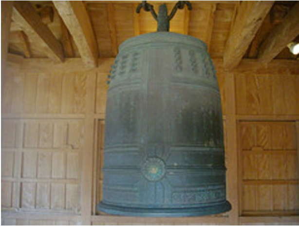
Bridge of Nations Bell (1458)

(Okinawa Prefectural Museum, Replica in Shuri Castle)