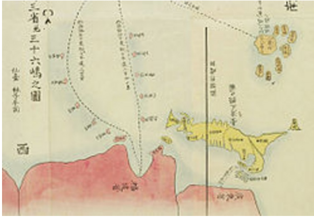
Hayashi Shihei's map from his Sangoku tsuran zusetsu

(General outline of three countries), 1785 26