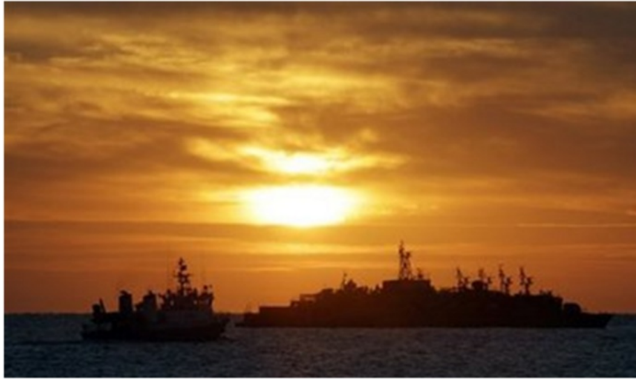
ROK ships near Yeonpyeong Island in the aftermath of the shelling

Frequent large scale joint exercises between the US and ROK militaries, under US command, which have been a feature of the peninsula for decades, stretch back in various forms to the late 1940s. The ROK military also has its own exercises, with little ostensible US involvement. Though since it is dependent on the US for high-tech intelligence – surveillance from aircraft and satellites, and signals interception – the Americans are never far away. In addition, the ROK military is under the wartime operational control (OPCON) of the US. Former President Roh Moo-hyun had negotiated for the US to relinquish operational control in 2012 but under Lee this has been pushed back to 2015. 19 Control of Joint military exercises was also scheduled to be transferred to the ROK, but this has also been rescinded. 20