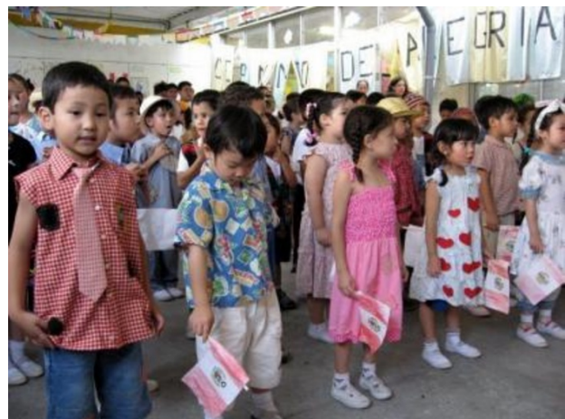
Immigrant children in a suburban Tokyo school celebrate Peru's independent day