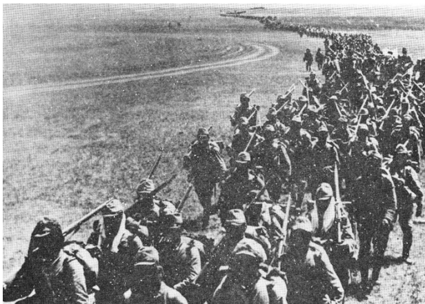
Japanese forces on the march at Nomonhan

The pretext for war, the casus belli , may not be reflected in what follows. Japan attacked China in 1937 in the name of containing communism, preventing its export from the USSR in to China. China never gave much credence to this justification for the invasion, not least because Japanese forces made only one aggressive move against the USSR, at Nomonhan in Mongolia, in 1938. The result was disastrous for Japan. Rather than attack the communist Soviet Union, Japan attacked the anti-Communist Guomindang (GMD) which ruled China. By the end of the war the pretext of attacking communism was not only threadbare but contradictory; by 1945 the Chinese Communist Party (CCP), far stronger than it had ever been, was poised for success in the subsequent Civil War. The political beneficiary of the war was the CCP; it came to power in the aftermath of the war, hardened by the war, and ready to take on the GMD.