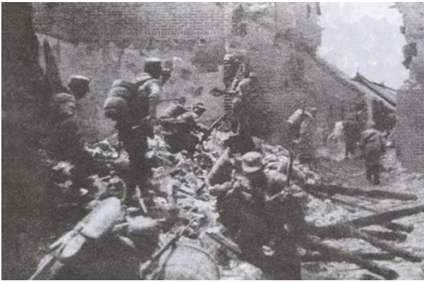
Chinese nationalist troops in action against Japan

see in my parents' exhausted faces the toll this was taking, but they remained stoic through the inconveniences and discomfort.