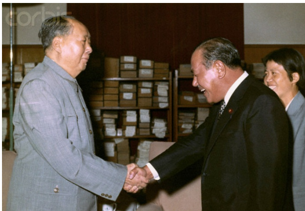
Mao and Tanaka, 1972

The most momentous outcome of the war was the communist victory, the victory of the socialist revolution. Mao Zedong was clear about this. In 1972, on the first visit of a Japanese leader to China since the war, Mao responded to Prime Minister Tanaka Kakuei's stilted efforts at a veiled apology by virtually thanking him for Japan's invasion of China. 'If Japan hadn't invaded China, the Chinese Communist Party would not have been victorious; moreover, we would never be meeting today. This is the dialectic of history.'