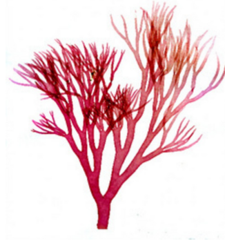
The Four Newly Discovered Sea Grasses of Oura Bay