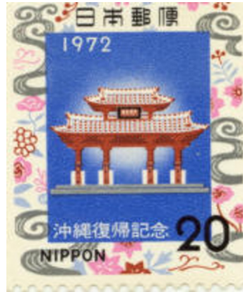
Postage Stamp Commemorating “Reversion” of Okinawa/Ryukyu to Japan, 1972

Ginowan township, but it is far more than Futenma. What is planned is a vast, sophisticated military complex at Henoko, far more multi-functional than Futenma (and including a deep-sea port for docking nuclear submarines). This relatively remote northern Okinawa site has become the “hottest” land and sea district in all Japan.