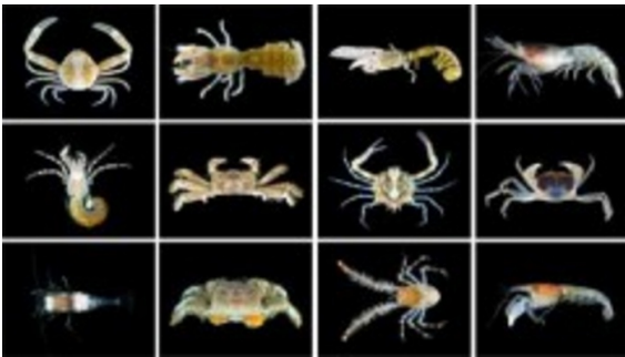
New Crab and Shrimp Species discovered in Oura Bay