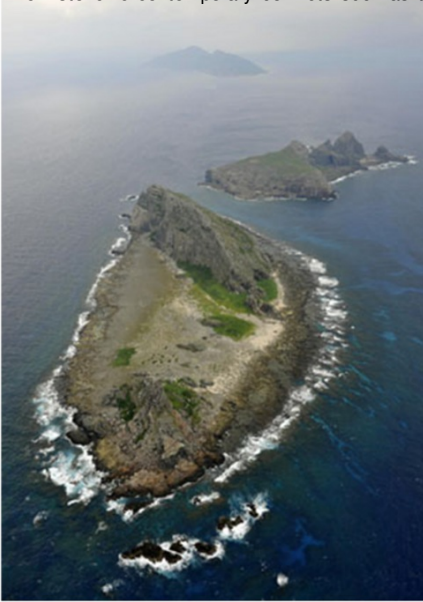
A view of the Diaoyu/Senkaku islets