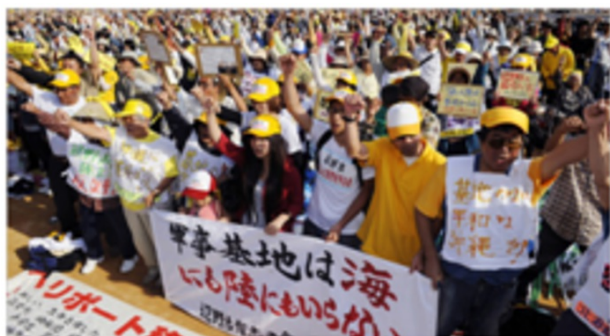
90,000 anti-base demonstrators rally at Yomitan, April, 2010