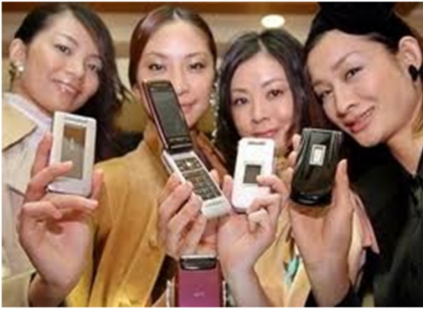
Have keitai, will travel

depth and analytical coverage which frequently puts to shame the print press. Far and away the highest quality, and most fearless, writing on America's wars and the geopolitics of the contemporary era can be found in myriad online sources including several of those mentioned above, and this is true not only in Anglophone literature but also in Japan in such sources as Tanaka News and many blogs, and in the Chinese blogosphere, just as Wikipedia has rapidly established itself as a major (if controversial) source of encyclopedic information.