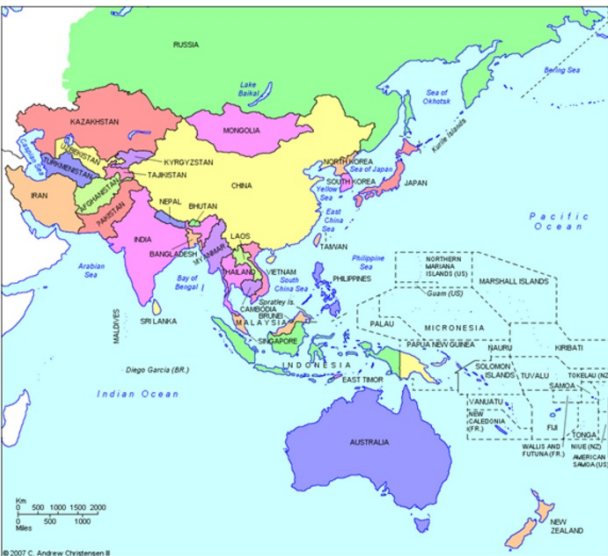
A standard map of the Asia-Pacific, which excludes its dominant power, the US

The developments described above need to be grasped within the framework of global changes in the nature of capital leading to the gravest economic crisis of the postwar era in the years 2007-present, the collapse of the Soviet Union, the American permanent warfare state, the resurgence of Asia in recent decades and profound environmental challenges, with new social and political forces rising to address all of these issues. Where will the research-based ideas emerge from to challenge powerful military, political and economic forces at work in the new millennium? It is certain that they will not be spawned from within the institutions dominated by media and publishing conglomerates.