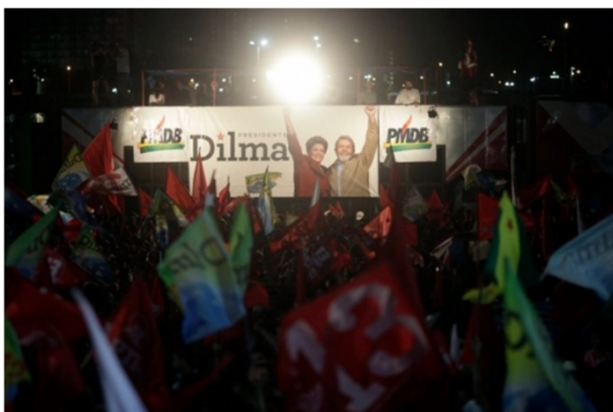
GlobalPost leader on November 1, 2010 features the election of the Brazilian President

Second, the new technologies that gave rise to the internet and multiple electronic publications and new forms of communication such as blogs and social communication networks, have transformed both the economics of publishing and the nature and size of readership. Notable trends include the radical decline in newspaper, magazine and journal readership and subscribers, and the shift from print to on-line publication and reading. Among the major casualties in the decline of the print press is the demise of international reporting. The Wall Street Journal in early 2009 noted that "Tribune Co., which owns the Los Angeles Times and Chicago Tribune, is in talks with the Washington Post Co. about a deal to pay the Post for foreign and national coverage for Tribune's eight major dailies. Meantime, The New York Daily News has reached an agreement with a Boston-based start-up called GlobalPost to use the company's network of part-time foreign correspondents. Together the agreements could substantially overhaul the foreign news operations of three of the 10 largest U.S. newspapers."