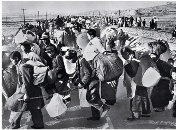
Refugees flee fighting near Pusan, South Korea.

Scores of articles on war and historical memory controversies, compensation and reconciliation can be accessed through our index, here .