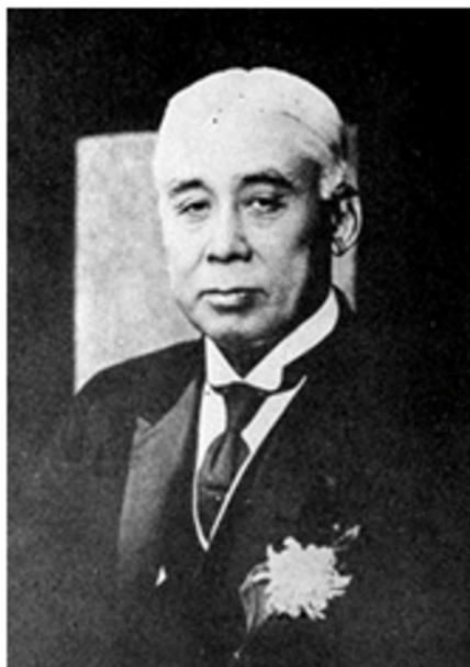
Hara Takashi, Japanese Prime Minister (1918-1921)