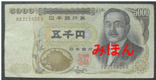
Nitobe Inazō, Educator, appeared on Japan's 5000 yen bill