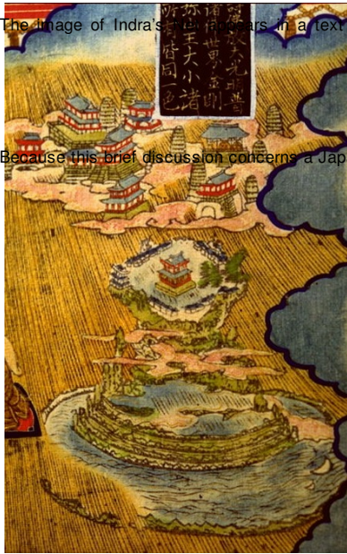
Mount Sumeru and other mountains illuminated by Amida's light

called the Avatamsaka Sutra (a shortening of the Sanskrit title Buddhāvataṃsaka-nāma mahāvāipulya sūtra , Huayan-ting in Chinese and Kegon-kyō in Japanese) a composite text, sections of which circulated and continue to circulate independently.