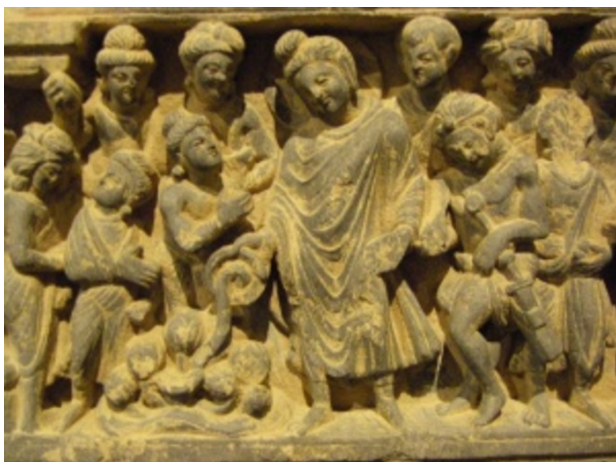
Buddha subdues the serpent and converts onlookers. Gandhara 2nd-3rd century

Suddenly I saw three heavenly children before me. They wore the thinnest robes, woven, it seemed, from frost, and transparent shoes, standing on the water's edge, peering intently into the eastern sky, as if waiting for the sun to rise. The eastern sky was already alight with whiteness. From the folds in their robes I could tell they were from Gandhara. I recognized them as being from a fresco that I had excavated at the ruins of the great Khotan Temple. I approached them quietly and greeted them in a very low voice, so as not to frighten them.