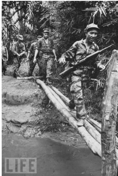
US Special Forces and Montagnard troops in Vietnam

There were, of course, top advisers such as Walt Rostow and the Joint Chiefs of Staff who persisted in believing that more bombing would produce the desired results. But what the above excerpts reveal is that lost faith in bombing did not end it; rather, bombing became a show of national resolve, essential for the next time . The key national interest, John McNaughton (a top adviser to Secretary of Defense Robert McNamara) would say in the same memo just quoted, was no longer about saving Vietnam. U.S. aims were now