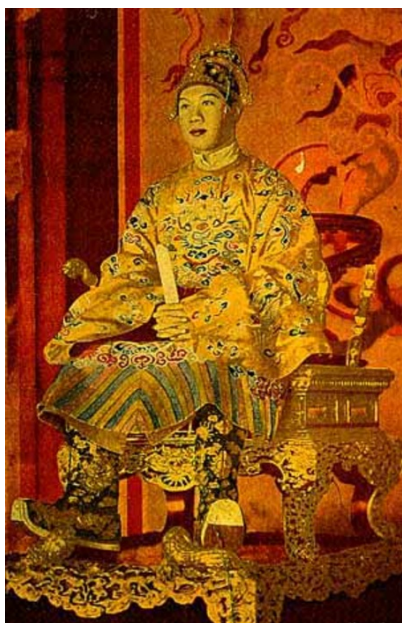
Emperor Bao Dai

These and other official assessments prophesied that the loss of even a single country to communism would be the beginning of a political and economic disaster for U.S. interests. Consequently, whereas before Korea, the security community's advice to the president was to support the "Bao Dai solution" and sustain the French war effort, after Korea—and as the French effort began to fail—the United States was looking for ways to contain a presumptively Chinese threat and prevent a negotiated capitulation to Ho Chi Minh's forces. Thus, NSC 5405 rejected any political solution, including a coalition government in Vietnam, and instead stated: "It will be U.S. policy to accept nothing short of a military victory in Indo-China." 27