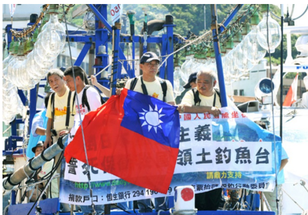
Anti-Japanese activists from Taiwan, Hong Kong and Macau unfurl a protest banner and Guomintang flag and chant slogans on a boat in Yeliou on September 13, 2010