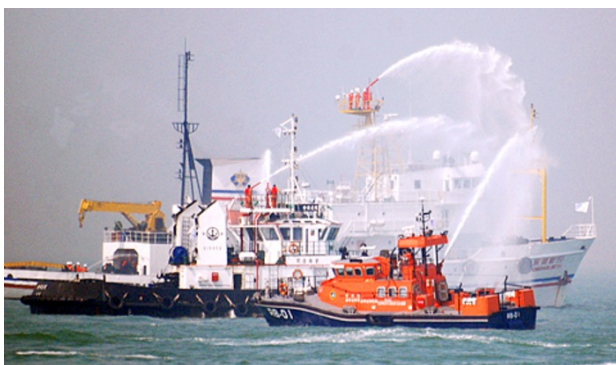
Rescue boats from Taiwan and China take part in a joint exercise on September 16, 2010

There's one more thing. Taiwan under Guomindang rule is irritated by Japan's opposition to China. Japan and the US carry out military exercises in the name of protecting Taiwan from Chinese invasion. But Taiwan itself is conducting joint military exercises with China for search and rescue in a friendly manner in the Taiwan straits. China is conducting joint military exercises for search and rescue activities with Central Asia, Russia, India and so forth, with whom China has become friendly in recent years, as part of a military reconciliation strategy. China's honeymoon with Taiwan toward future friendly relations is beginning. Link.