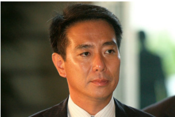
Foreign Minister Maehara Seiji

In case the US leads Japan to become hostile toward China, the person with the greatest potential as an agent for Japan is the new Foreign Minister Maehara Seiji, who has controlled the Coast Guard as Minister of Land and Transport and also has good connections with US policymakers. In the new cabinet, Maehara becomes Foreign Minister, which means that Japan is likely to become more hostile toward China. It may be that the US pressed Prime Minister Kan to appoint Maehara to the post. Okada resisted the change, but ordered by Kan, he stepped down and, in his place, the pro-US dependence Maehara became Foreign Minister.