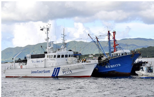
Japan Coast Guard detains Chinese fishing boat