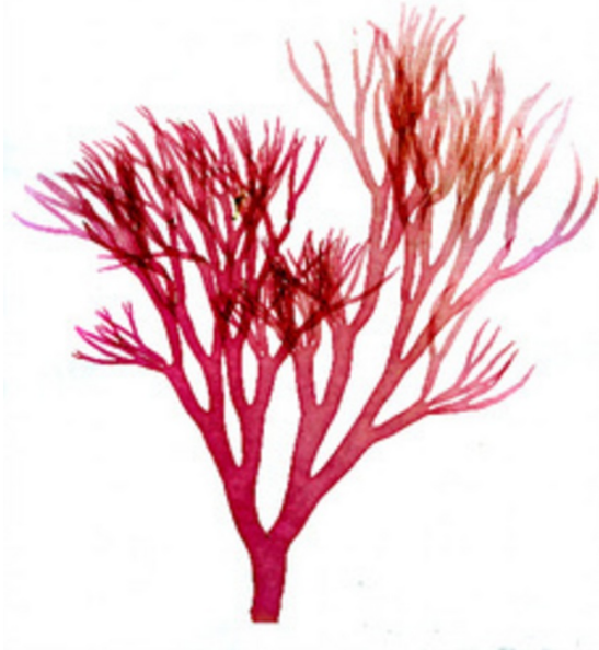
The four newly discovered sea grasses of Oura Bay

(Photographs by Ohba Hideo of Tokyo University of Marine Science and Technology)