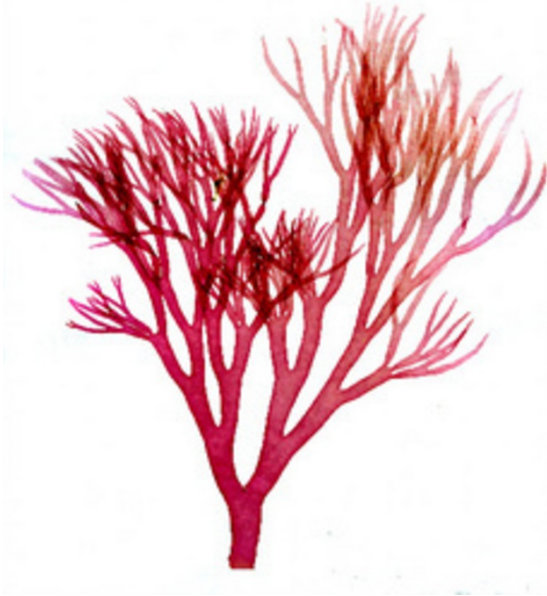
The four newly discovered sea grasses of Oura Bay