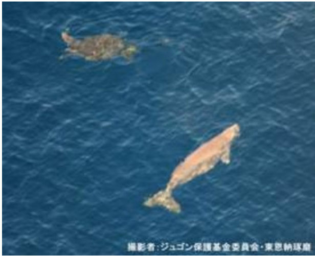
Dugong and sea turtle in Oura Bay