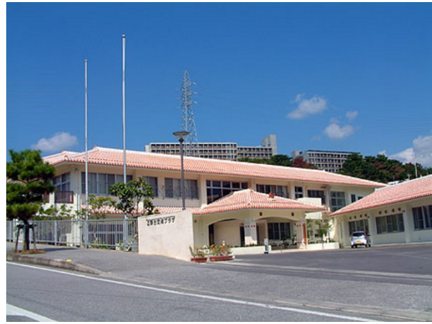
Henoko Exchange Plaza