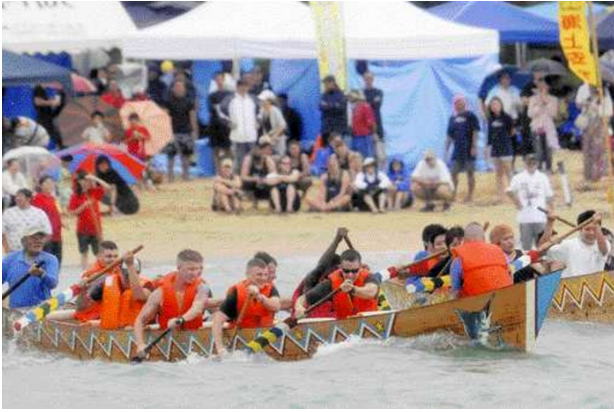
US Marines and locals compete in Henoko Dragon Boat Festival, 6 June 2010.