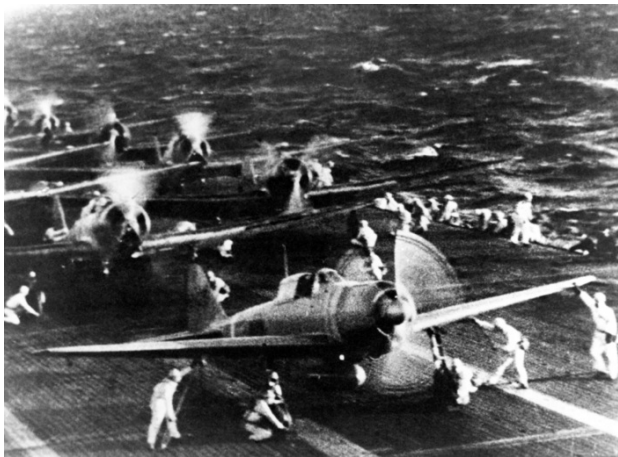
Japanese attack planes taking off

Such good luck, together with negligence on the part of the arrogant enemy, enabled us to launch a successful surprise attack. 3