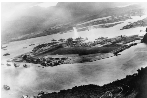
Japanese aerial photograph of the first torpedo bombs hitting U.S. warships on Battleship Row

Yamamoto obviously misread American psychology disastrously when expressing hope that the surprise attack would strike a crippling blow at morale. The Americans, however, also disastrously misread and underestimated the Japanese. Can there be a more precise confirmation of Yamamoto's perception of Japan being "despised" and made light of as a "small enemy" than Kimmel's frank reference to "those little yellow sons-of-bitches"?