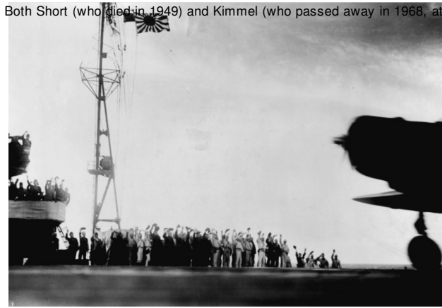
Japanese crew cheers torpedo plane taking off from the Shokaku , one of six aircraft carriers in the attack force