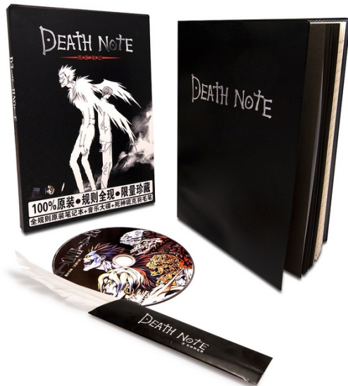
Figure 1. Packaging and contents of the "100% imported" Death Note DVD set, including a music CD, purchased from a small DVD shop on the main street of a Shanghai suburb in early 2009.

Though it was not licensed by any Chinese distributor and was eventually banned by the government, the Death Note franchise has gained popularity and notoriety within China. To better understand the controversy surrounding Death Note (see Figure 1) in the Chinese context, this article explores the historical precursors to the Chinese Communist Party's ban on horror films, and examines the attitudes of Chinese students studying at an Australian university, some of whom had acquired the film illegally through internet piracy while they were still in China.