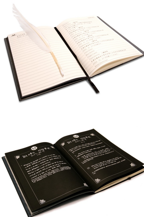
Figure 3. The notebook and accompanying quill pen included with the Death Note DVD set available at unofficial DVD shops in China. The black notebook pages show the instructions for using the book.

Death Note tells the story of a young genius named Yagami Light. At the beginning of the series, a bored death-god named Ryuk randomly hurls a magical notebook (see Figure 3) out into the world. The notebook is discovered by Light, who learns that if a person's name is written in the notebook, that person will die – but when the writer eventually dies, their soul will belong to Ryuk. Despite the cost, Light decides that the death note has the power to save the world from evil, and he begins writing down the names of evildoers all over the world. Most media in the Death Note franchise follow Light's conflicts with international law enforcement – because as soon as people realize that these mysterious deaths are actually murders, then the hunt for the killer (aka “Kira”) begins.