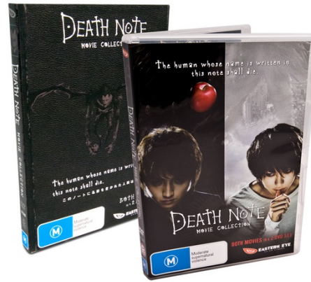
Figure 5. The Australian double DVD release of the live-action Death Note series. The saying “The human whose name is written in this note shall die” appears on the external front cover of the packaging as well as on the front of the DVD case.

Though Chinese-language versions of the Death Note manga and anime have been legally published in Taiwan and Hong Kong, neither have been released in mainland China through any official channels. The manga was distributed by Taiwanese Tong Li and Hong Kong-based Animation International Ltd., while the anime aired on Hong Kong’s TVB Jade and on the Animax channel in both Hong Kong and Taiwan. All of these versions are written in traditional Chinese script, not the simplified script used in mainland China, and in some cases are dubbed into spoken Cantonese. The live-action movies were also aired with traditional Chinese subtitles in these regions – in fact, the first film was the most successful Japanese film in Hong Kong in ten years (Comi Press, 2006; Elley, 2007) – but they were certainly not among the limited number of foreign films imported by the Chinese Film Corporation.