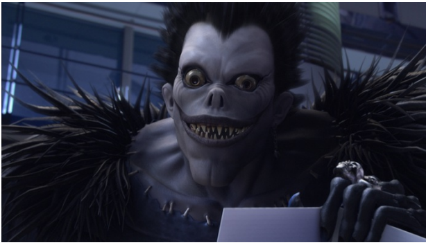
Figure 4. Ryuk.