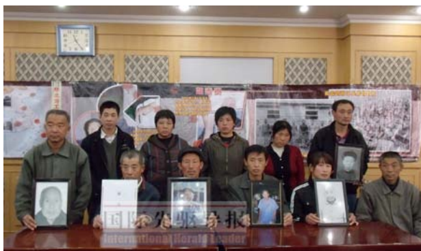
The five plaintiffs in the Shinanogawa lawsuit against Nishimatsu, along with heirs of two other victims, announce their opposition to the compensation pact at a Beijing press conference on April 27.

The truth is that all the plaintiffs of the Nishimatsu-Shinanogawa forced labor lawsuit in Japan, who were confirmed by both Nishimatsu and the plaintiffs' Japanese attorneys in June 2009 as the representatives to negotiate with the company, did not sign any settlement agreement with Nishimatsu. The root cause for this are: (a) Nishimatsu insisted to state in the content of the Nishimatsu-Shinanogawa Settlement Agreement [2] that "Chinese people's right to claim had been waived", but did not allow the plaintiffs to express side by side in the Settlement Agreement that they could not accept this wrong viewpoint; (b) In order to make clear its unyielding position of not taking any legal liability, Nishimatsu deliberately uses the term "atonement money (償い金)" to ambiguously name the damages that they should have paid to the Chinese victims; and (c) Moreover, Nishimatsu unreasonably requires those who accept the "settlement" to bear hereafter the obligation of ensuring that the corporation will be immune from any future liability from any other parties for this case. This article discusses these and other shortcomings of the unacceptable "settlement" in detail.