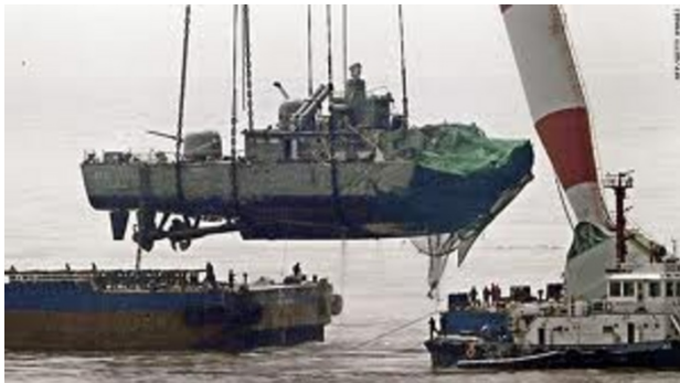
The stern of the Cheonan lifted from the water

Mainstream media coverage of responses to the findings has, with rare exceptions, reiterated the findings of the ROK report, not only in the United States and South Korea but throughout Europe and the Anglophone world as well. These analyses typically accept at face value the report's findings of DPRK guilt—the "overwhelming" evidence of the torpedo's DPRK manufacture and markings, two DPRK submarines out to sea at the time of the Cheonan's sinking, and the absence of submarines from neighboring countries in the area at the time of the sinking.