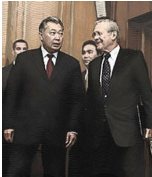
Bakiyev and Rumsfeld