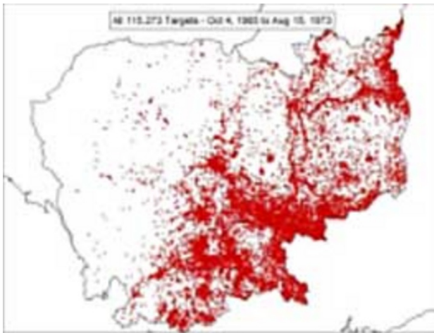
Map showing 115,273 targets of U.S. secret bombing of Cambodia between October 1965 and August 1973.