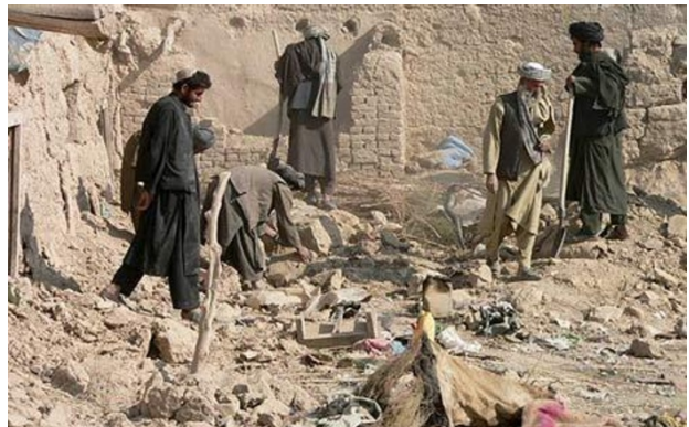
This is not