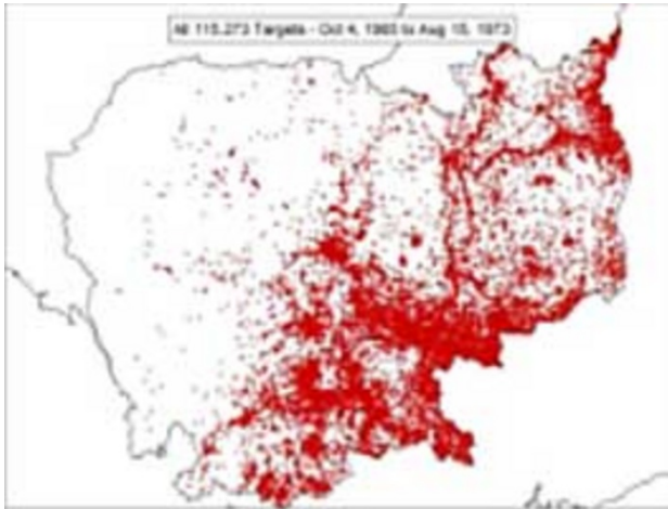
Map showing 115,273 targets of U.S. secret bombing of Cambodia between October 1965 and August 1973.