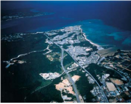
Camp Schwab, Eastward to Henoko Point and Oura Bay.

Japan was made responsible for conducting a pre-construction environmental assessment of the replacement site (known as a habitat of dugong, an endangered species protected under Japanese and U.S. law), land-filling the waters around the peninsula, building the new facility at its cost by 2014, and then handing it rent-free to the United States for use by the Marine Corps. The Guam relocation was conditional on "1) tangible progress toward completion of the FRF, and 2) Japan's financial contributions to fund development of required facilities and infrastructure on Guam."