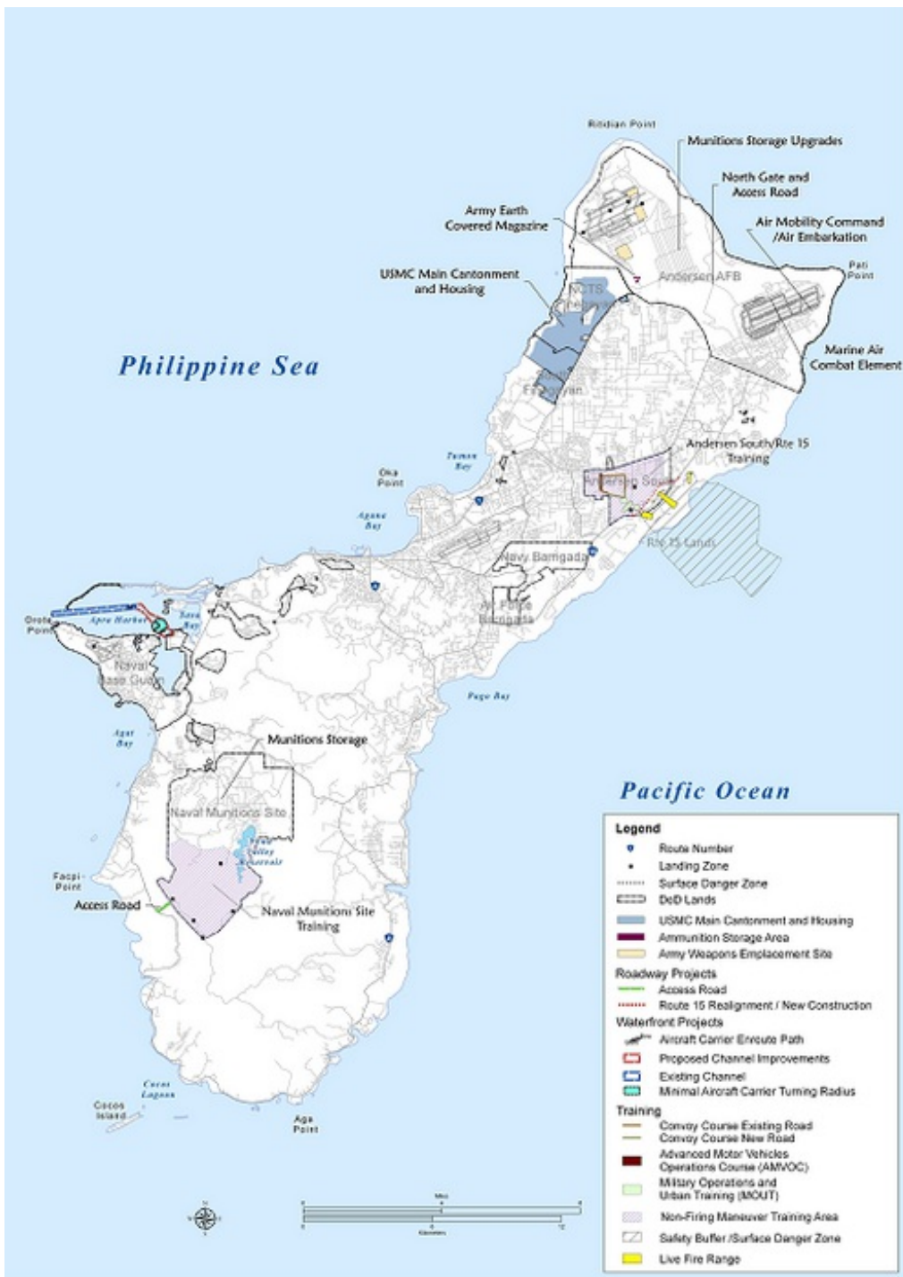
Proposed Military Buildup in Guam (from Joint Guam Program Office , United States Navy , Proposed Action/Guam")