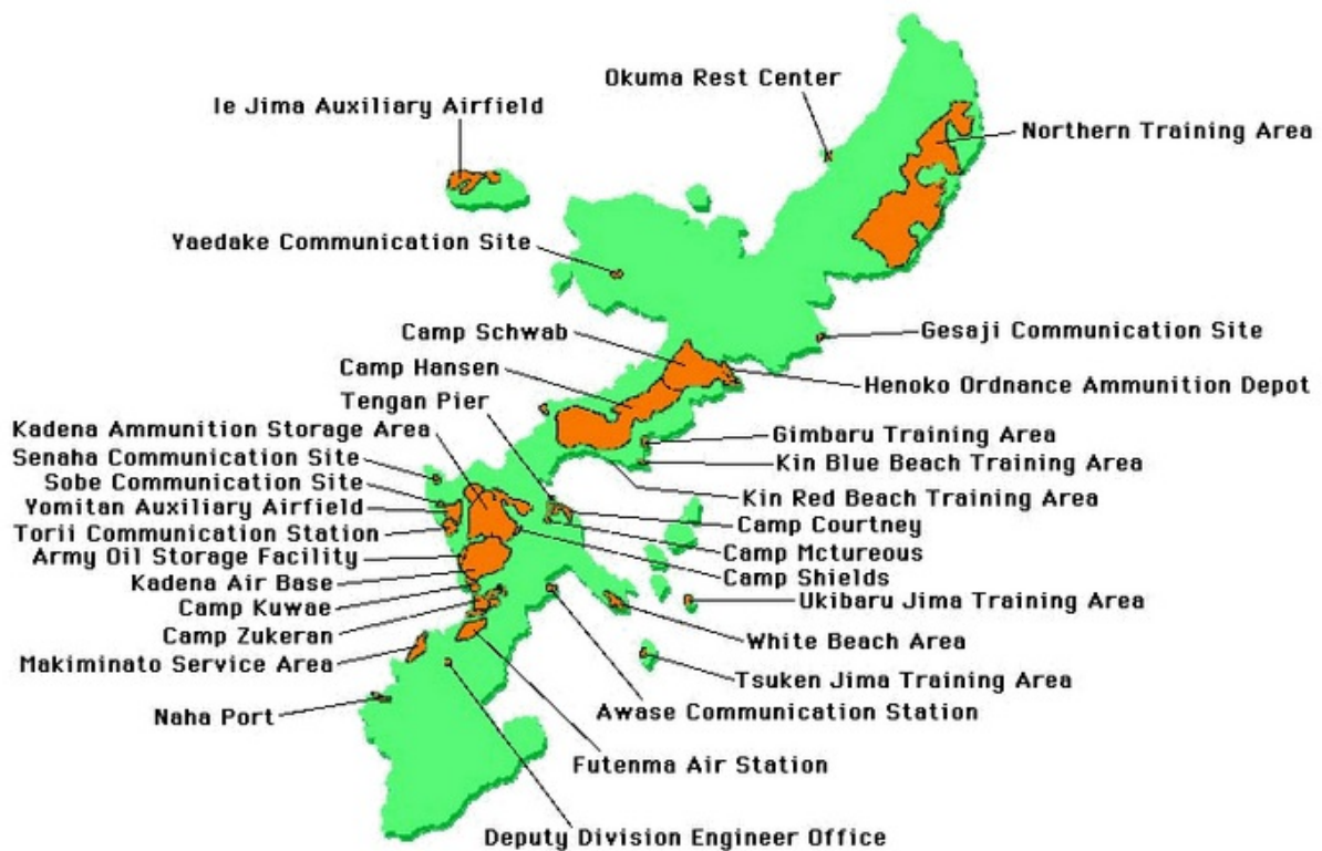
Okinawa Prefectural Government, U.S. Military Bases in Okinawa (2004)

Marine Corps Air Station Futenma, located in the middle of a residential area of the city of Ginowan (population 91,000) north of the capital Naha, reportedly stations 2000 to 4000 personnel of the 1st Marine Aircraft Wing of the III Marine Expeditionary Force. Helicopters and fixed/wing aircraft are constantly flying low in circles over the residences, schools and hospitals for embarkation and touch-and-go exercises, creating roaring noise and the danger of crashes. People are so concerned that they have long been demanding its closure and return, with particular urgency since 2004 when one of Futenma's heavy helicopters spiraled into the wall of the administration building of a university right across the fence and splattered its broken pieces all over during the summer break. In 2006, the Japanese and U.S. governments agreed to relocate many Okinawa-based Marines to Guam by 2014 to lessen the Okinawan people's burdens or to accommodate "the pressing need to reduce friction on Okinawa." MCAS Futenma would be returned, but only after being replaced by a new facility that Japan would construct within Okinawa.