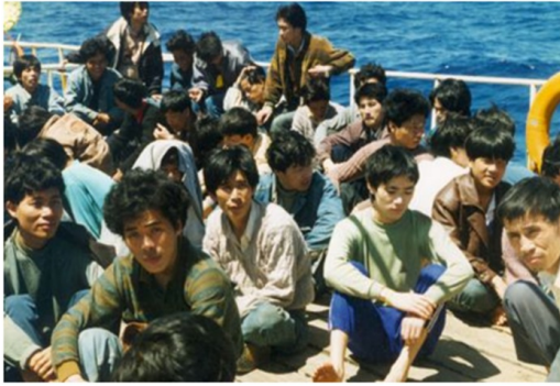
Fujian undocumented migrants on the deck of a fishing boat.