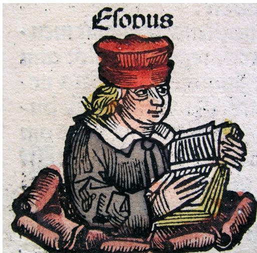
Aesop as depicted in the Nuremberg Chronicle by Hartmann Schedel in 1493.