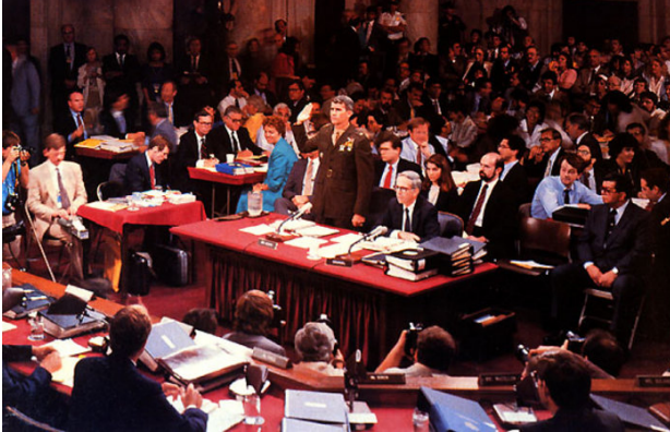
Oliver North at the Iran-Contra Hearings

In July 1987, during the Iran-Contra Hearings grilling of Oliver North, the American public got a glimpse of "highly sensitive" emergency planning North had been involved in. Ostensibly these were emergency plans to suspend the American constitution in the event of a nuclear attack (a legitimate concern). But press accounts alleged that the planning was for a more generalized suspension of the constitution.