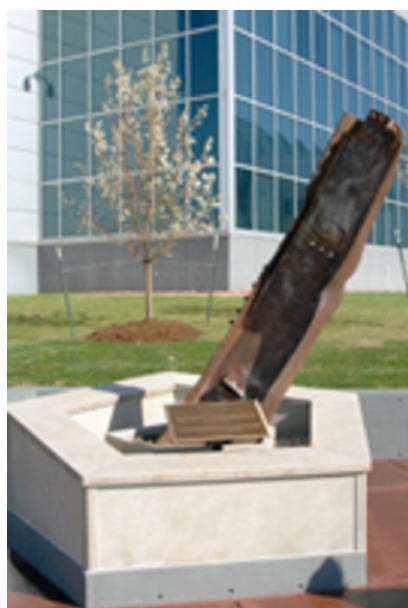
Northcom. US Northern Command Headquarters at Peterson Air Force Base, Colorado

At the same time we have seen the implementation of the plans outlined by Chardy in 1987: the warrantless detentions that Oliver North had planned for in Rex 1984, the warrantless eavesdropping that is their logical counterpart, and the militarization of the domestic United States under a new military command, NORTHCOM. 13 Through NORTHCOM the U.S. Army now is engaged with local enforcement to control America, in the same way that through CENTCOM it is engaged with local enforcement to control Afghanistan and Iraq.