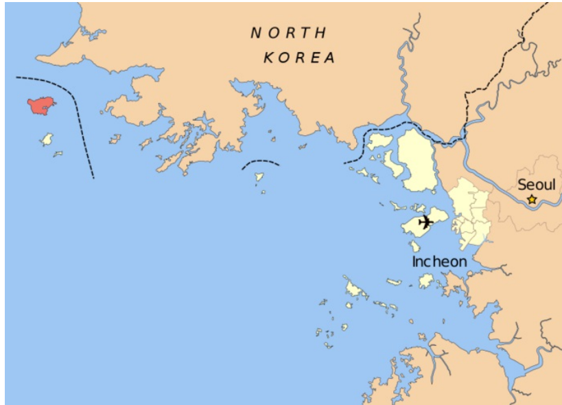
Map of Baengnyeong Island (1)