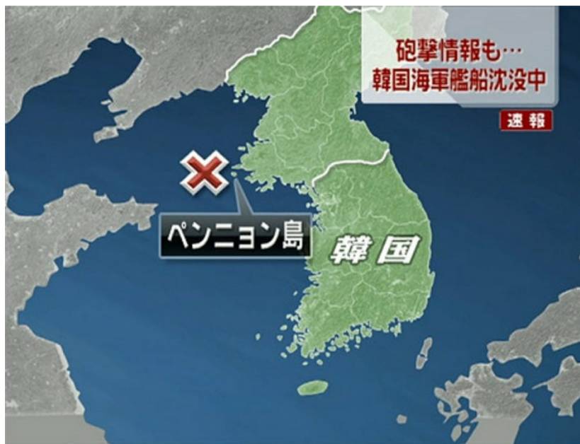
Map of Baengnyeong Island (2)

In the vicinity of Baengnyeong Island South Korea constantly confronts the North Korean military. The Cheonan was a patrol boat whose mission was to survey with radar and sonar the enemy's submarines, torpedoes, and aircraft, and to attack. If North Korean submarines and torpedoes were approaching, the Cheonan should have been able to sense it quickly and take measures to counterattack or evade. Moreover, on the day the Cheonan sank, US and ROK military exercises were under way, so it could be anticipated that North Korean submarines would move south to conduct surveillance. It is hard to imagine that the Cheonan sonar forces were not on alert.