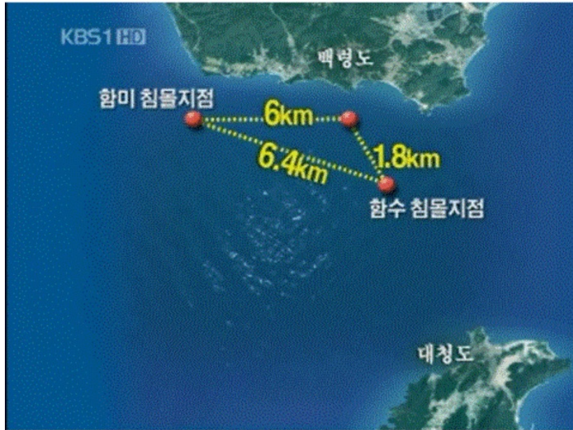
A map provided by KBS TV. The third buoy to the East of Baengnyeong Island is where the head of the Cheonan sank, and the rear of the Cheonan sank to the West.