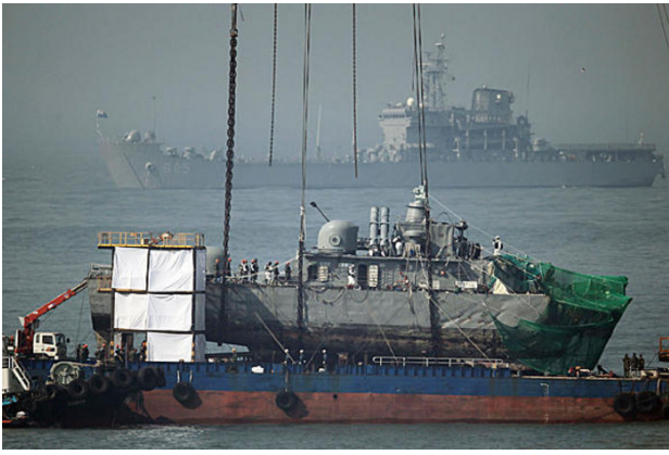
The stern of the Cheonan docked on a barge off Baengnyeong Island on 7 May, 2010.