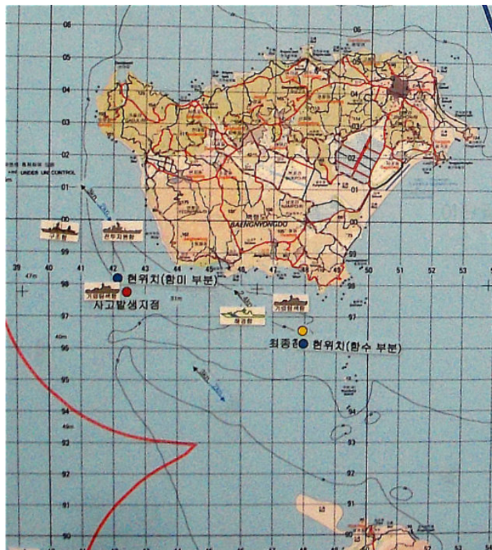
The map of the search generally reported: two black dots to the South of Baengnyeong are where the halves of Cheonan reportedly sank. The third buoy is not shown.