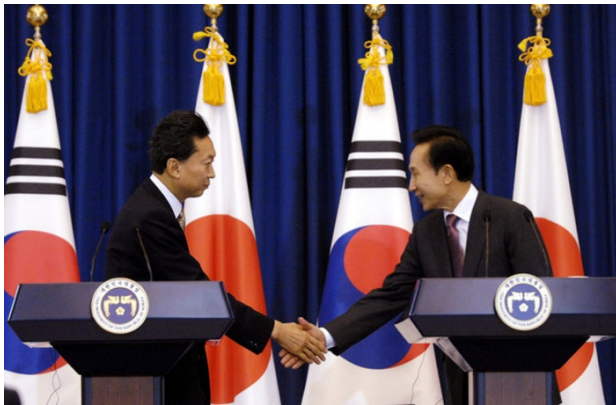
Hatoyama (left) and Lee in Seoul, October 9, 2009

Hatoyama Yukio, the new Prime Minister of Japan, has chosen to entertain the possibility of a paradigm shift in how Japan deals with China and South Korea. In a June 2009 visit to the Republic of Korea as head of the Democratic Party of Japan (DPJ), when elaborating on his vision for an East Asian or Asian-Pacific Community, Hatoyama drew on the Franco-German experience of creating a regional organization for embedding their relationship on foundations of permanent peace.