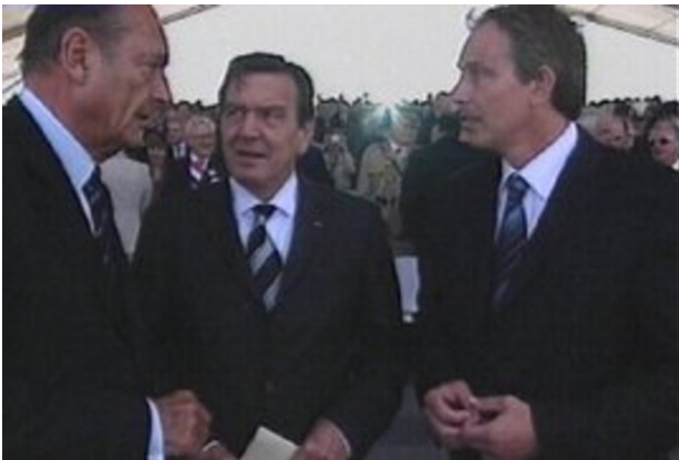
Chirac, Schröder and Blair at D-Day Ceremony

The second set of activities dealing on a regular basis with the past, but in an affirmative way, are the actions of various civil society organizations. There are too many to enumerate, but we can identify three that are present in the Polish case and across the other three cases: the bilateral textbook commission, the Action Reconciliation/Service for Peace ( Aktion Sühnezeichen/Friedensdienste ) and the German Historical Institute. Neither Israel nor the Czech Republic has the latter in formal terms, but they do have some equivalent: the German-Czech Historians Commission ( Deutsch-Tschechische Historikerkommission ) and the Institutes of German History in Tel Aviv and Jerusalem. These three organizations in all cases are linked in their goals (education about the past; inculcation of a "culture of remembrance" - Erinnerungskultur ), means (meetings, publications) nature of history (broad conception but with a focus also on World War II and the Holocaust) and effect (creation of bilateral networks; successor generations; and a model for other international dyads).