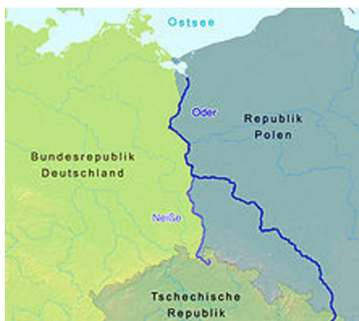
The 1970 Warsaw Treaty between Germany and Poland settled outstanding border issues with the Oder-Neisse line

The second stage of history’s shaping role in reconciliation, Germany’s acknowledgment of grievances, involved converting the affective, moral component into pragmatic and material needs and formal political commitment. In the Polish case, as with France, Israel and the Czech Republic, the acknowledgment entailed the language referring to historical issues in bilateral treaties and in major statements as well as symbolic expressions of reconciliation. For example, the December 1970 Treaty between the Federal Republic of Germany and the People’s Republic of Poland on the Basis for Normalizing Their Relations acknowledged Poland as “the first victim” of a murderous World War II and recognized the Oder-Neisse line as Poland’s western border, albeit de facto and not de jure. 13