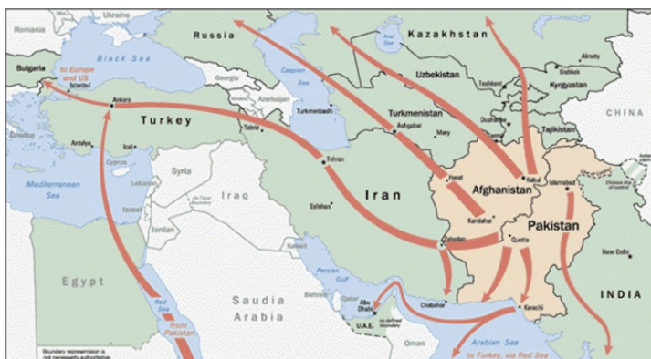
CIA map tracing opium traffic from Afghanistan to Europe, 1998. The CIA cite, updated in 2008 states “Most Southwest Asian heroin flows overland through Iran and Turkey to Europe via the Balkans.” But in fact drugs also flow through the states of the former Soviet Union, and through Pakistan and Dubai.