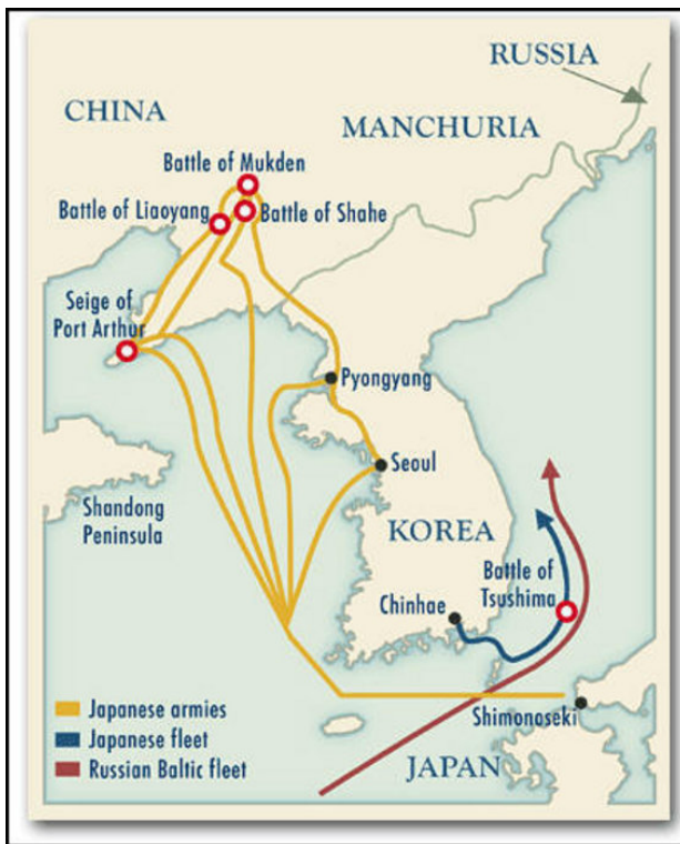
Map showing events of Russo-Japanese War of 1905

2010 is the centennial year of Japan's takeover of Korea. The history of this event is of enormous significance to the 20th century, and not simply because it garnered Japan a foothold on mainland Asia. Although Koreans see it very differently, for Japan, the 1910 annexation of Korea established Japan's entry as a power on the world stage.