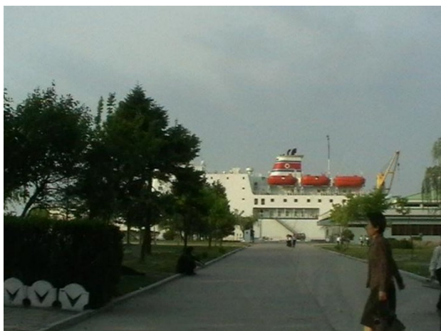
The ferry Mangyongbong lying idle in the North Korean port of Wonsan, May 2009

On December 14, 2009 in a relentless rain, about seventy people gathered at the end of a non-descript pier at the city's major downtown port to mark 50 years since the departure of the first ferryboat leaving Japan for North Korea. In 1959, 975 people boarded a Soviet-flagged ship that day and sailed from Niigata to great fanfare and publicity. 92,365 others would follow, with most leaving Japan during the program's first few years. After the program ended, the service continued regularly, and throughout — first with the Soviet "Kurlion" and then the North Korean "Mangyongbong" — the ships coursed a well-known route.