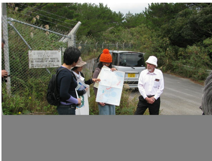
Author being briefed at the site of the Helipad Sit-In, Higashi village, Yambaru, Okinawa, 6 December 2009.

In Okinawa, however, the Hatoyama DPJ election victory of August 2009, marked not only by the national party's electoral pledge to relocate the Futenma base outside the prefecture but by the clean sweep within the prefecture of committed anti-base figures, was taken as signalling that a new and favourable tide to Okinawa was rising. Opposition to any "within Okinawa" Futenma relocation became almost total across the political spectrum. When a committed anti-base candidate was elected mayor of Nago City on 24 January 2010, the threat to Oura Bay (and its dugong, coral and turtles) seemed drastically diminished. Having witnessed the lies and deceptions by which over 13 years the temporary, pontoon-supported "heliport" gradually evolved into the giant, reclamation, dual-runway and military port project of 2006, and having experienced the emptiness of the promise of economic growth in return for base submission, Okinawans were in no mood to be tricked again.