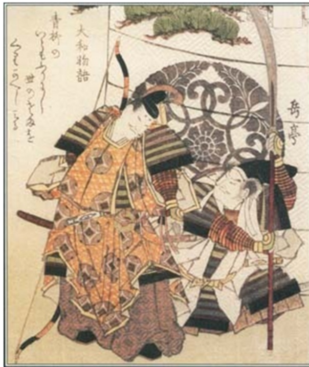
Yamato-takeru, mythical warrior who appeared in the Kojiki and Nihongi

One 'myth' which has had a significant impact on public policy in modern times is the 'myth' of homogeneity discussed earlier. Even those who deride this discourse as 'illusory' acknowledge its influence on postwar Japan; Ishi (2005: 271) describes it as "a master narrative that has not changed drastically even today." Of course, 'homogeneity' can mean different things; however, when the Japanese are referred to as a tan'itsu minzoku (homogenous people) living in a tan'itsu minzoku kokka , the meaning is typically one nation, one race, and one language/culture. Much like the leaves of a clover, the three elements are portrayed as part of a whole (Burgess 1997: 99). The key term is minzoku which, like a modern day equivalent of Smith's ethnies, encompasses more than just race or ethnicity. Morris-Suzuki (1998: 32, 87) defines it as the Japanese version of the German Volk , a term combining cultural and genetic aspects which emphasises the organic unity of the Japanese people/nation as a community "bound together by ties of language or tradition." Over the years there have been a great many statements by the Japanese political elite referring to the Japanese as a tan'itsu minzoku :