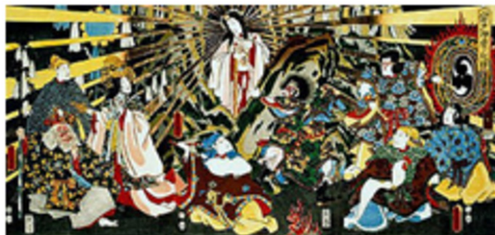
Amaterasu, the sun goddess emerging from a cave to bring light to the universe

Unfortunately, the influence of Nihonjinron on constructing social reality in Japan has often been overlooked by scholars more interested in trampling the 'bleeding corpse' (Gill 2001: 577) of a genre of writing that has come to represent something of a straw-man par excellence . As Reader (2003: 111) suggests, the central problem is that critics, perhaps "beguiled by the self-defining rhetoric of uniqueness that pervades nihonjinron", have come to see such discourses as 'unique' to Japan while, at the same time, underestimating the particularities of Japanese culture. In fact, as the following sections illustrate, the opposite is in fact true: Nihonjinron, in the narrow sense of a discourse on national identity, is not unique but the historical materials it draws on and the national culture it helps to (re)create are.