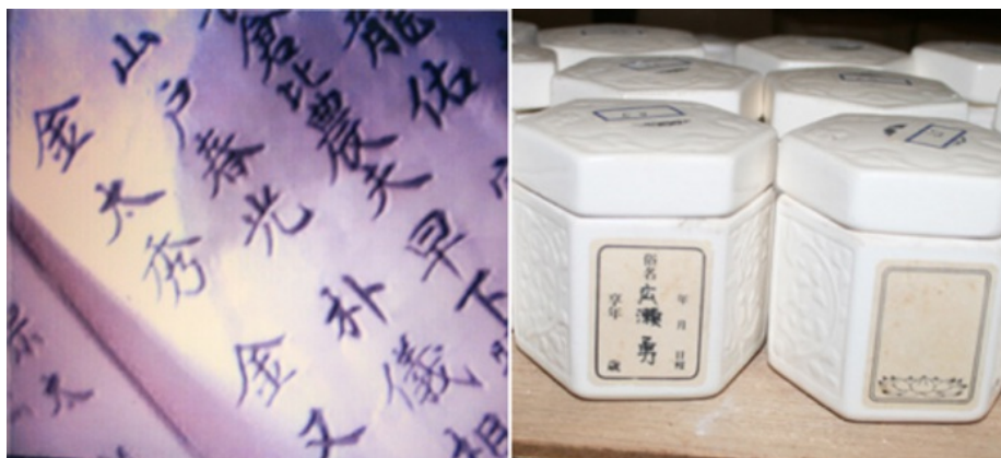
Korean names that were on urns in the “Senninzuka” ossuary (left) were replaced by numbers when the urns were transferred to Kinshoji temple (right).