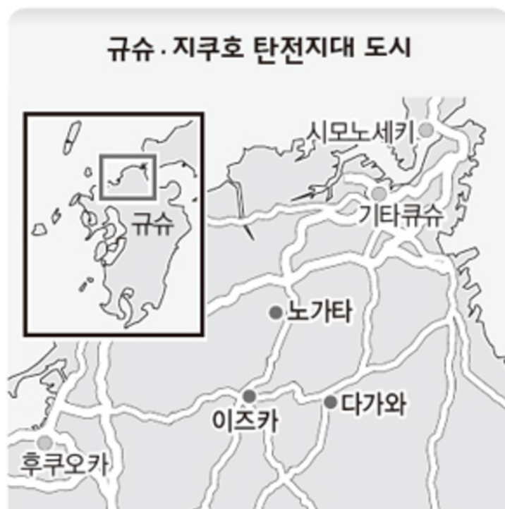
Korean map of the Chikuho region of Kyushu, Japan

Nowadays it is difficult to find any trace of the old mines in Chikuho. The top three mining centers here are Iizuka, Nogata and Tagawa. Currently, the only place where the pithead remains intact is the Hoshu mine site in Tagawa's Kawasaki Village. This is because the government gave instructions that the pithead be filled up for safety reasons when the mine was shut down. The Hoshu Mine, where a residential area stands today, is a placer mine where the shafts descend obliquely. They go down a full kilometer, and it is said that it took a miner 30 minutes to walk down and another hour to come back up. After the mine was shut down in 1945, its coal exhausted, it stayed alive for rescue training purposes.