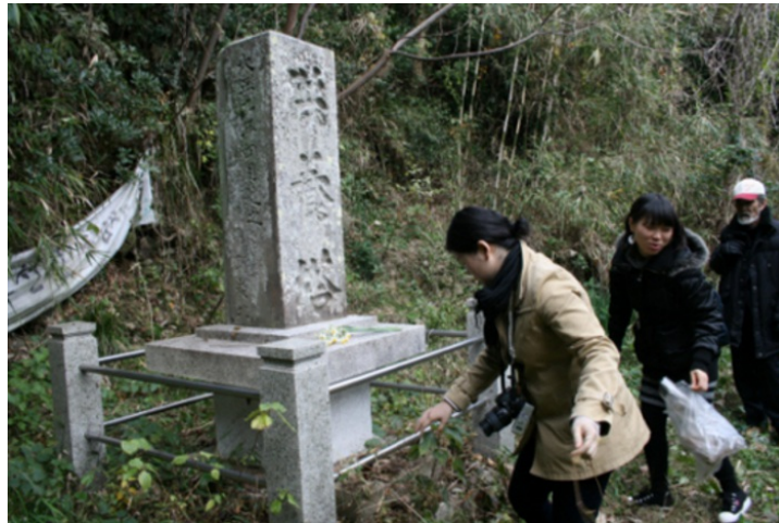
Staff members of the Oka Masaharu Memorial Nagasaki Peace Museum clean the “Senninzuka” memorial tower, which originally contained an ossuary underneath.

groups protested, charging that expressions such as “sharing joy and sorrow” flew in the face of historical fact, but the company refused to modify the inscription, claiming that it had already passed through prior discussions with the local headquarters of the Korean Residents Union in Japan (Mindan) and the General Association of Korean Residents in Japan (Chongryon). It was in the midst of this controversy that the destruction of the inscription took place.