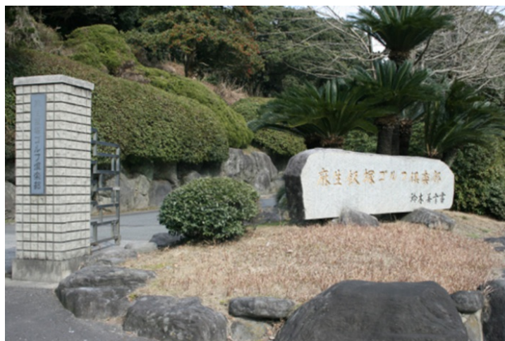
A view of the front gate at the Aso-Iizuka Golf Club, of which former Japanese prime minister Taro Aso is chairman. (Kim Hyo Soon)

A map of such burial sites for the dead of Yoshikuma Mine without surviving family, drafted by Aso Mining for internal use, was filled with records of where remains were located. It indicated there were no fewer than 504 sets of remains. Thirty-three had stone markers, twenty-one had wooden markers, and the remaining 450 had no markers at all. The map was never disclosed by Japanese media. It is now almost impossible to determine the identity of the remains, since any materials that might provide a clue are no longer extant. Nearly all of the Japanese who did physical labor in mines during the Japanese Empire were from the lower class. Second and third sons of poor farming villages without rice paddies to inherit went to work at the mines if they had no better means of survival. A number of them were burakumin, subject to discrimination from society. When people died, those who had no one to take their remains were simply buried in the ground. Even if there was an intention to cremate them, the high price of coal resulted in their effective abandonment.