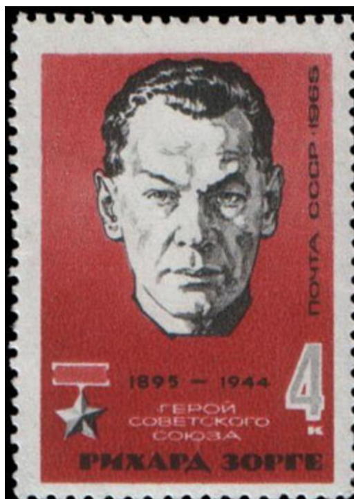
Stamp of honor: Richard Sorge, the Soviets' Tokyo masterspy executed in Tokyo in 1944, was commemorated on this 1965 4-kopeck Russian stamp.