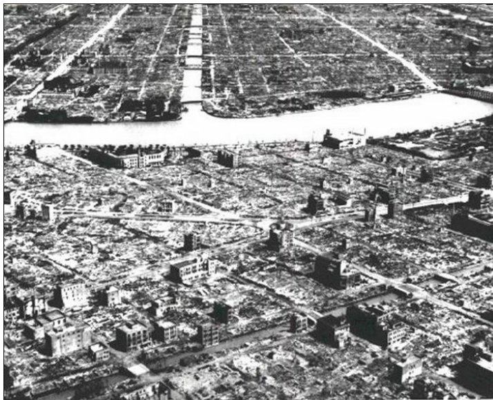
Tokyo after the firebombing of March 9-10, 1945

First, one might, at least tentatively, try taking the authors at their word. It is important to recall the historical moment , and the geographical place , where this Constitution was written. This was immediately after the end of World War II, in Tokyo, a city that had been flattened and burned by the U.S. terror bombings. It is said that you could stand in the center of Tokyo and see the horizon in every direction.