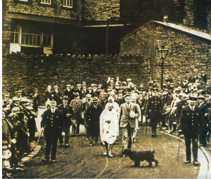
Gandhi in London in 1931 for the Round Table Conference

In 1931, on his way to the London Round Table Conference, Mahatma Gandhi was asked by a Reuters correspondent what his program was. He responded by writing out a brief, vivid sketch of "the India of my dreams". Such an India, he said, would be free, would belong to all its people, would have no high and low classes, no discrimination against women, no intoxicants and, "the smallest army imaginable." (2)