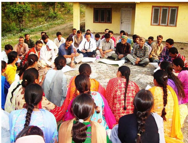
Panchayat in a contemporary village

But aside from the strategic disadvantage, raising and supporting a military would be impossible given the structure of the panchayat federation. The issue is not whether the military should be large or small, but whether the All-India Panchayat would have the state's right of belligerency. A body with only advisory powers standing over a collectivity of village republics would not have the power to recruit an army, much less to command it. And there can be no military without the power to command. Command, and the power to punish disobedience to command, is the essence of military organization. When you dispatch a body of troops carrying weapons and trained to use them, it is not to give advice.