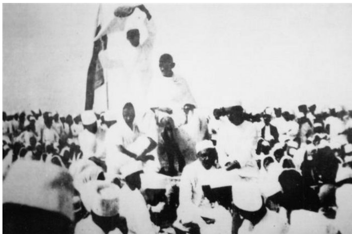
Gandhi in 1930 satyagraha

Satyagraha spoils this game. By renouncing the right to attempt to kill the enemy, satyagraha denies to the other side its primary justification to use violence. By the very rules of just war theory, what the soldiers are doing cannot be just war, and therefore begins to look like criminal behavior. This puts terrific pressure on both the individual soldiers and their commanders. One imagines them longing for just one act of violence from the satyagrahis, so the situation can be fitted back into their preconceived notion of how war is carried out. This may help to explain Gandhi's controversial decision to call off the anti-Rowlett Bill satyagraha campaign after some violence broke out on the anti-government side. For the issue is not one of degree: reducing the amount of violence as much as possible. If any violence at all is used by the satyagraha side this restores the logic of the just war game, and thus restores the legitimacy of the violence used by the other side. "Murder" again becomes "war".