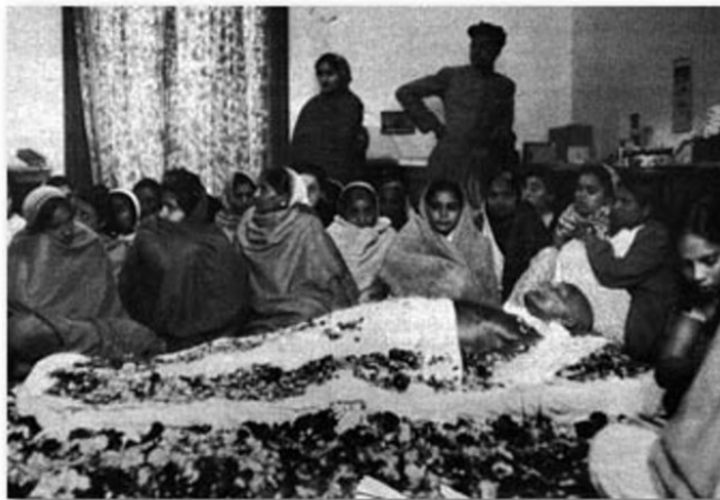
Gandhi in death

And while he was not able to bring this peace to all of India – without the support of his party, how could he? – his local successes showed that in principle it could be done. Once again, he was transforming impossibilities into possibilities, in this case demonstrating the possibility, even in the most bitterly violent of situations, of establishing a non-Hobbesian peace, what could be called radical peace . At the same time he was founding, village by village, the essence of his Panchayat Raj Constitution. It was while he was in the midst of this activity that he was assassinated.