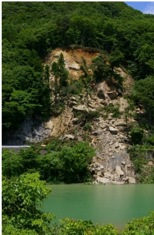
The Iwate-Miyagi Nairiku Earthquake