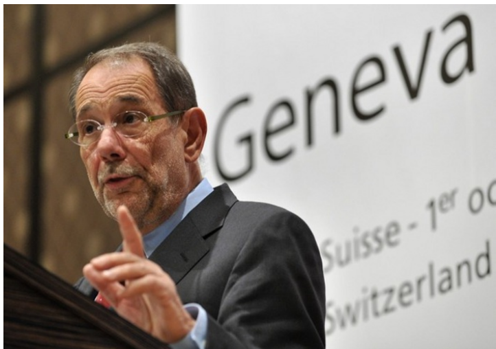
European Union foreign affairs chief Javier Solana

Resolution 242, passed in 1967 in the aftermath of the Six Day War (supported by Resolution 338, passed in 1973 to bring the Yom Kippur War to a ceasefire), calls for the withdrawal of all Israeli forces from occupied Palestinian territories and forms the basis of any durable political settlement between the two sides. But the four-decade-long occupation and denial of Palestinian self-determination and human rights demonstrates that, without positive action by the international community, the implementation of the two resolutions to bring about a just and lasting peace will go nowhere.