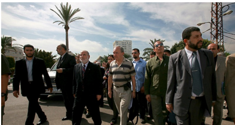
Richard Goldstone (in short-sleeve shirt), Head of the UN Fact Finding Mission on the Gaza Conflict, which produced the September 25, 2009 "Goldstone Report"

It seems clear that with Israel-Palestinian negotiations long stalled, while Israel continues its inexorable building and consolidation of illegal settlements, that the Japanese diplomatic position, if it is a serious one, requires a focus on the positive steps the world community can take (such as the Javier Solana proposal) to finally implement 242.