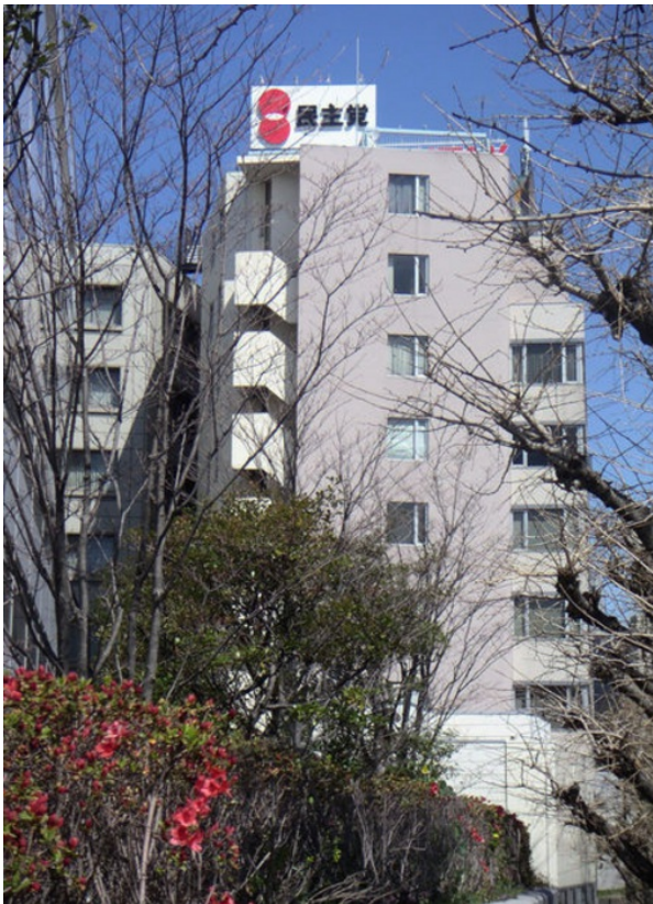
Democratic Party of Japan (DPJ) headquarters in Tokyo