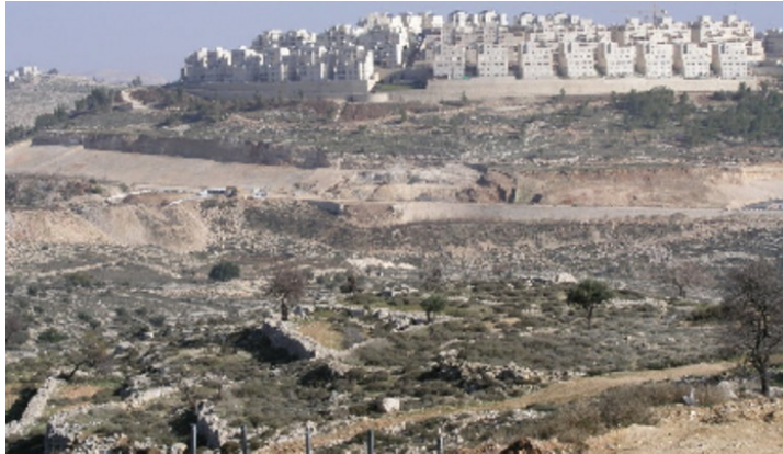
Israeli settlements in the West Bank designated for development funding in December 2009

The comment by Japan added to an international chorus of criticism of Israel's latest plan to build on Palestinian land in Jerusalem. US President Barack Obama said the action by Israel "embitters the Palestinians in a way that could end up being very dangerous." Britain's Foreign Secretary David Miliband said that the "decision on Gilo is wrong and we oppose it." A "credible deal involves Jerusalem as a shared capital," he said, so "expanding settlements on occupied land in East Jerusalem makes that deal much harder." United Nations Secretary-General Ban Ki-moon reacted to Gilo by affirming "his position that settlements are illegal, and calls on Israel to respect its commitments under the Road Map [a peace plan that foresees two Israel and Palestine states living side by side in peace and security] to cease all settlement activity, including natural growth." The current Swedish president of the European Union stressed that the EU's position is that "settlement activities, house demolitions and evictions in East Jerusalem are illegal under international law." Importantly, the president also noted that "such activities... threaten the viability of a two-state solution" and that the EU "has never recognized the annexation of East Jerusalem in 1967 nor the subsequent 1980 basic law," in which Israel claimed Jerusalem, including the occupied eastern half, as its "undivided" capital.