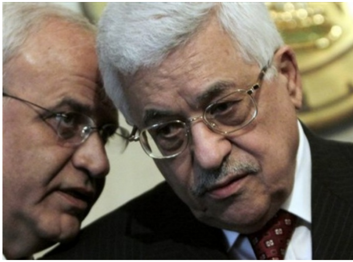
Palestinian President Mahmoud Abbas, right, consults with Chief Palestinian negotiator Saeb Erekat, left

As reported in Haaretz on November 15th, Chief Palestinian negotiator Saeb Erekat said that the Palestinians had decided to go before the UN Security Council after eighteen years of fruitless negotiations with Israel: "Now is our defining moment. We went into this peace process in order to achieve a two-state solution. The endgame is to tell the Israelis that now the international community has recognized the two-state solution on the '67 borders."