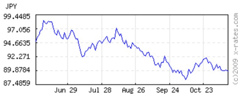
Yen to US$ exchange rate

The obvious rejoinder is that maybe some investors indeed plan to dump their yen and JGB holdings, but in the meantime, believe they can make money from the idiots out there who don't see how bad things are – and that they can get out in time. Buy the yen today at 90 to the dollar, wait until it crashes to 140, and pocket the 50 yen difference. In efficient markets land, this isn't supposed to happen, but any one who looks at the real world history of financial crises – the “Manias, Panics, and Crashes” of the late Charles Kindleberger's legendary book – knows that this kind of thing goes on everywhere; that everyone thinks he is smarter than the next guy and can get out in time – until he can't. This explanation would make sense if we were in the midst of euphoria about Japan; real killings in the financial markets are, after all made by people who bet against the herd and are then proved right. But the herd today – if articles like Evans-Pritchard's are any indication – believes Japan is headed over the proverbial cliff. It's pretty hard these days to find any bullish writing on the prospects for the Japanese economy.