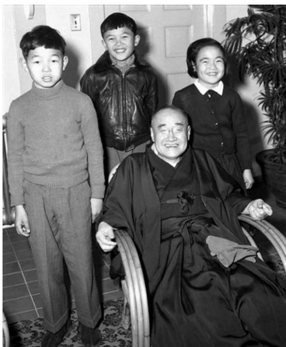
Prime Minister Yoshida Shigeru with his grandchildren in December 1952. (Asō Tarō rear center)

Emphasis on the party politicians' lack of political leadership and the use of prewar history to confirm their unacceptability did not end in spring 1946. The past served as a guide to the probable pattern of Japan's democracy to the immediate future. Thus the leadership of the democratic movement that would necessarily work through the political parties would be found outside the Diet rather than among the party politicians.[38]