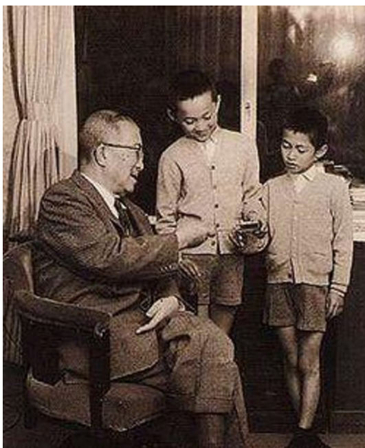
Prime Minister Hatoyama Ichirō with his grandsons Yukio (center) and Kunio (right)

The immediate postwar destiny of Hatoyama Ichirō and Yoshida Shigeru had much to do with the fact that although both were conservative and anti-communist, believed in capitalism, and had connections with big businesses, the occupation authorities recognized one of them as a party politician and the other as an old-school statesman. This assessment governed both the occupiers' early evaluations of Japanese conservatives and their decision-making after the April 10, 1946 Lower House elections.