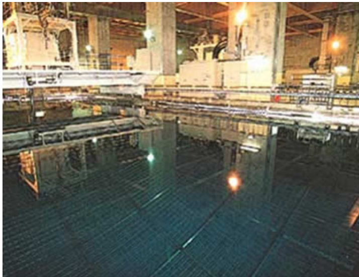
Rokkasho spent fuel receiving storage area

Originally, the company planned to spend about a year and a half on the trial operation of the facility. But more than three years have already passed since the launch of the test run.