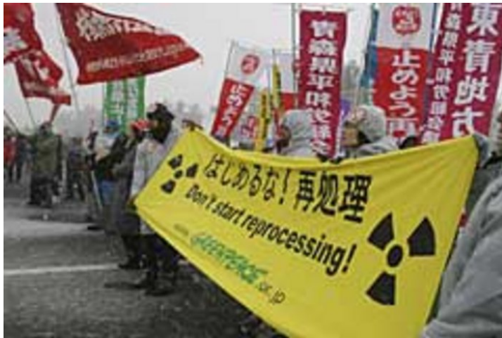
Protesters challenge Rokkasho

Originally, the company planned to spend about a year and a half on the trial operation of the facility. But more than three years have already passed since the launch of the test run.