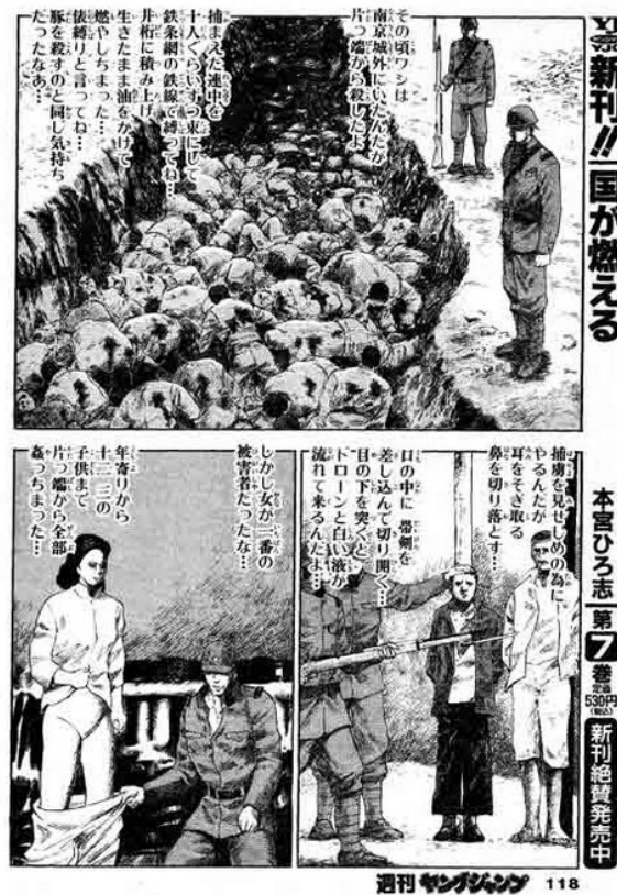
Illustrations from "My Country is Burning!"

At first glance, the handful of Tokyo rightists who created a furor about a graphic scene of the Nanjing Massacre in two September issues of the popular manga magazine Young Jump Weekly are a surprisingly tolerant lot. They restricted their complaint to technical issues in "My Country is Burning" (Kuni ga moeru!) by Motomiya Hiroshi, the only remotely educational series in a popular weekly comic book, and ignored 400 pages of gratuitous sex, violence, scatology and gore that dominates this illustrated publication with a reported circulation of 2 million.