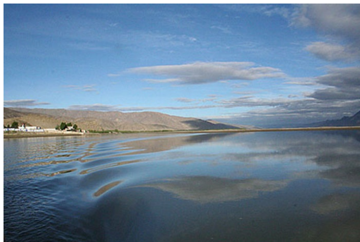
Brahmaputra river in Tibet

Water is indeed a matter of survival – not only for China, but for its neighbors. Most of Asia's major rivers – the Yellow, the Yangzi, the Mekong, Salween, Irrawaddy, Brahmaputra, Ganges, Sutlej, and Indus – draw on the glaciers and snowmelt of the Himalayas, and all of these except the Ganges have their source on the Chinese side of the border in Tibet. In many of these cases, no international agreements exist for sharing the waters of those rivers that cross borders, or even sharing data about them.