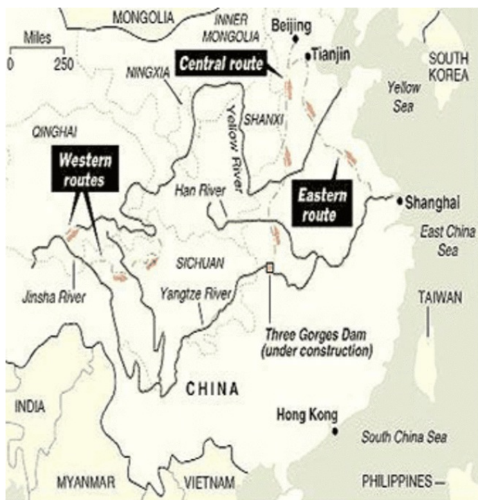
South-North water diversion plans

The project carries uncertainties commensurate with its size and cost. Among other things, there is considerable uncertainty about how dirty southern waters will be by the time they arrive in the north; diversions on this scale change flow speeds, sedimentation rates, and other important rates in unpredictable ways, and the original plans have already been modified to add more treatment facilities than were originally thought necessary. (Changes in water volume will also affect the ability of other rivers to scour their own beds – effects on the Han River, one of the Yangzi’s largest tributaries, are a particular concern.) Conveyance canals passing through poorly drained areas may also raise the water table and add excess salts to the soil – already a common problem in irrigated areas of North China – and salt water intrusion rates in the Yangzi Delta. 21 For better or worse, we will begin learning about the effects of the Eastern line soon, and probably about the Central line in just a few years.