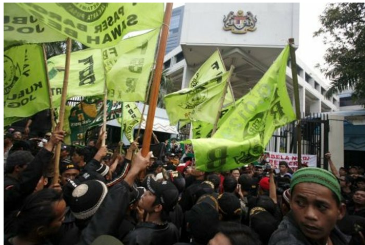
July 6 protest over Ambalat by the Betari Brotherhood Forum in front of the Malaysian Embassy in Jakarta

The area has been militarized. Indonesia has six warships and three warplanes in the area while Malaysia has several navy and coast guard vessels and aircraft there. Incursions by both sides into each others claimed waters have become increasingly frequent since the beginning of this year. Malaysia put bilateral talks on hold in April 2008. Things came to a boil on May 25 when an Indonesian navy vessel reported that it was only moments away from opening fire on a Malaysian warship that had allegedly encroached on claimed Indonesian waters. Some speculate that officials in Indonesia were using the incidents to pander to the Indonesian public in the run-up to the July 8 Presidential election. The Indonesian media certainly played up the saber rattling sound bites by Indonesian officials. Indonesian Defence Minister Juwono Sudaryono said "We are undeterred. Let Malaysia send military force and launch propaganda in Ambalat ...". An international relations expert said, "I am supportive of deploying Indonesian warships to Ambalat". Weighing in on the dispute in a rather alarming tone, Vice President Jusuf Kalla said Indonesia must take action and be prepared to wage war.