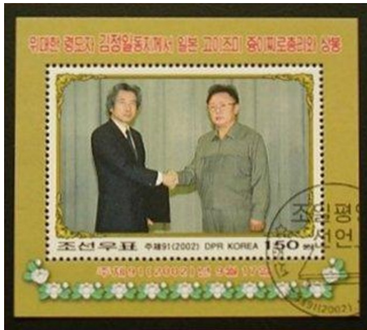
North Korean Stamp to Commemorate the Koizumi Visit